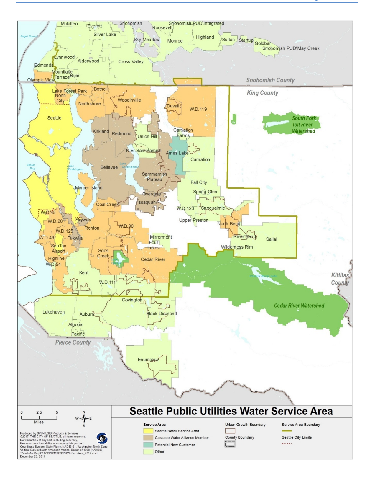
The entire 2019 Water System Plan can be found at: www.seattle.gov/util/WaterSystemPlan