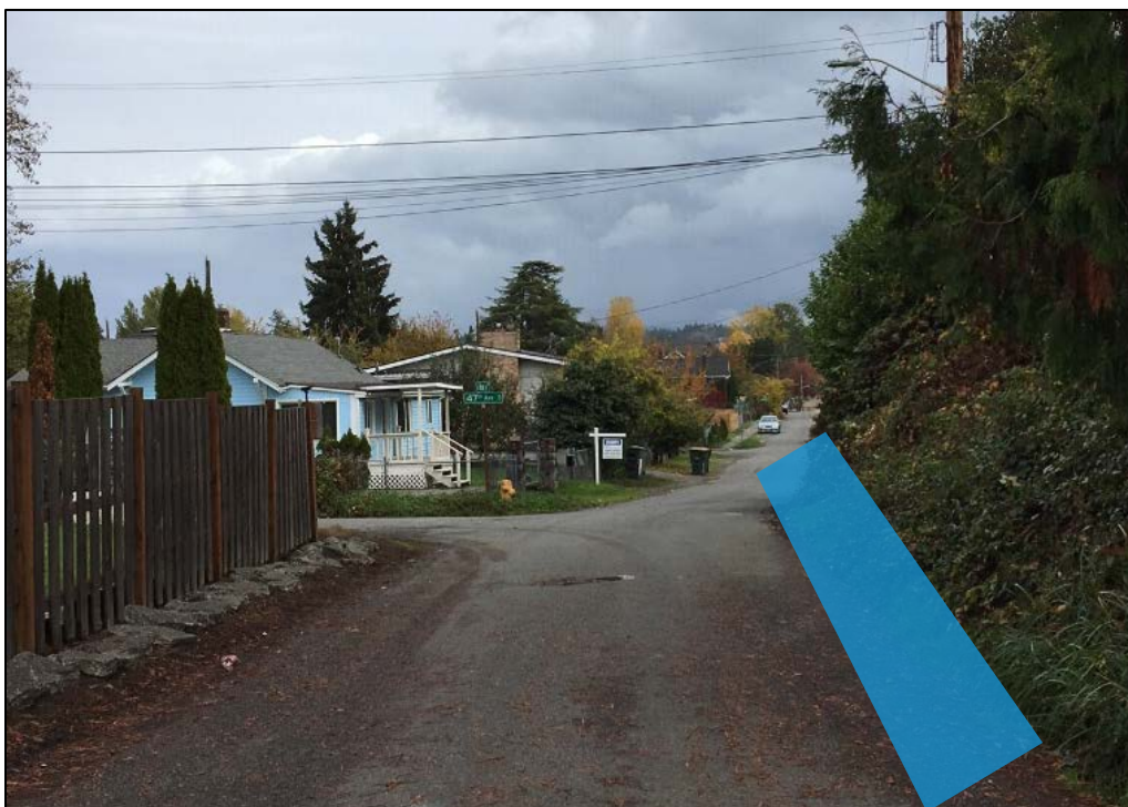
Photo of existing street (S Rose St between 46th Ave S and 48th Ave S)

Tagalog: Nagpaplano kaming maglagay ng bagong sidewalk sa 2020 upang gawing mas ligtas at mas madali para sa mga bata ang paglalakad papunta sa paaralan (tingnan ang mapa). Mangyaring tumawag para sa pagsasalin: (206) 727-8697.