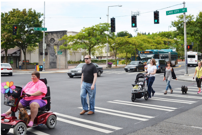
A routinely busy crossing: NE 125th St & Lake City Way NE

We’re working closely with the Washington State Department of Transportation (WSDOT) to enhance safety, accessibility, and travel on Lake City Way NE. WSDOT plans to repave the corridor and upgrade ADA curb ramps, and we will construct spot and intersection improvements to enhance walkability and safety for all travelers.