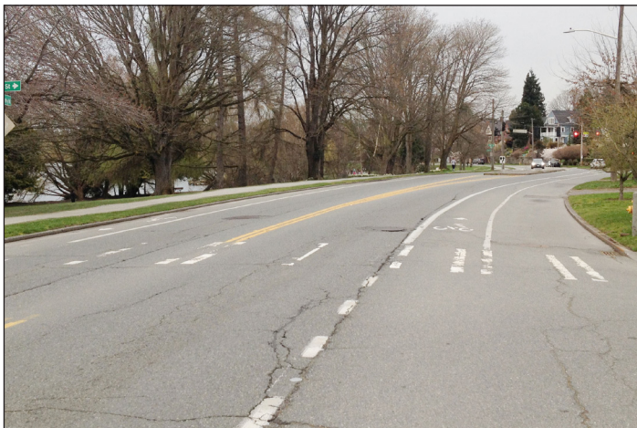
E Green Lake Way N & N 63rd St (looking north)

We prioritize paving based on pavement condition, traffic volume, geographic equity, cost, and opportunities for grants or coordination with other projects in the area.