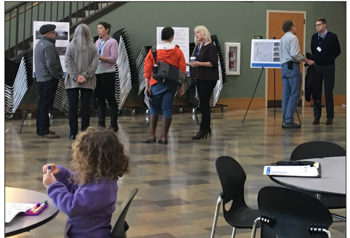
2018 Paving Projects public meeting