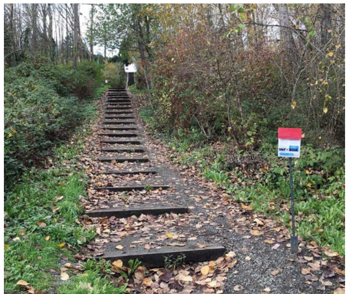
Existing stairway at S Hanford St between Cheasty Blvd S and Morse Ave S

This project is funded by the 9-year Levy to Move Seattle, approved by voters in 2015.