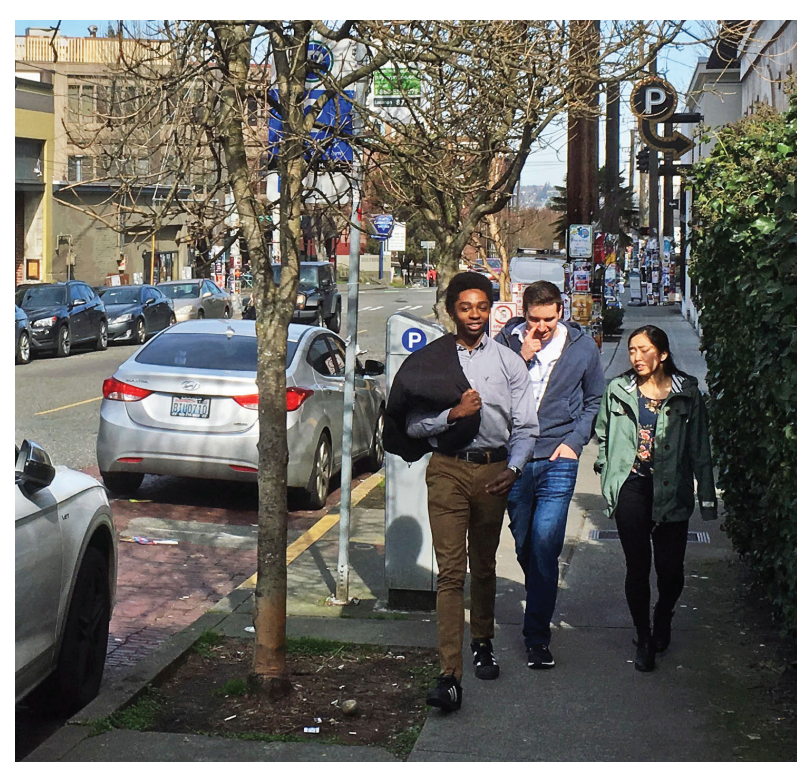
People walking on Melrose Ave between E Pine St and E Pike St