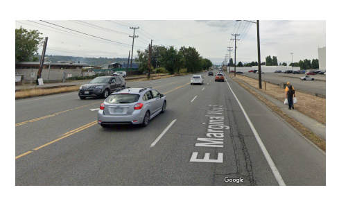
Existing: E Marginal Way S looking northbound