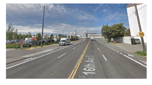
Existing: 16th Ave S (north of South Park Bridge) looking northbound