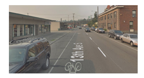
Existing: 13th Ave S looking northbound