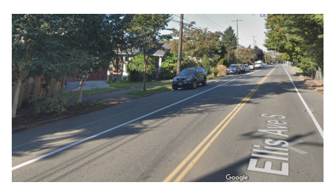
Existing: Ellis Ave S looking northbound