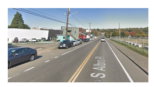
Existing: S Albro St looking northbound