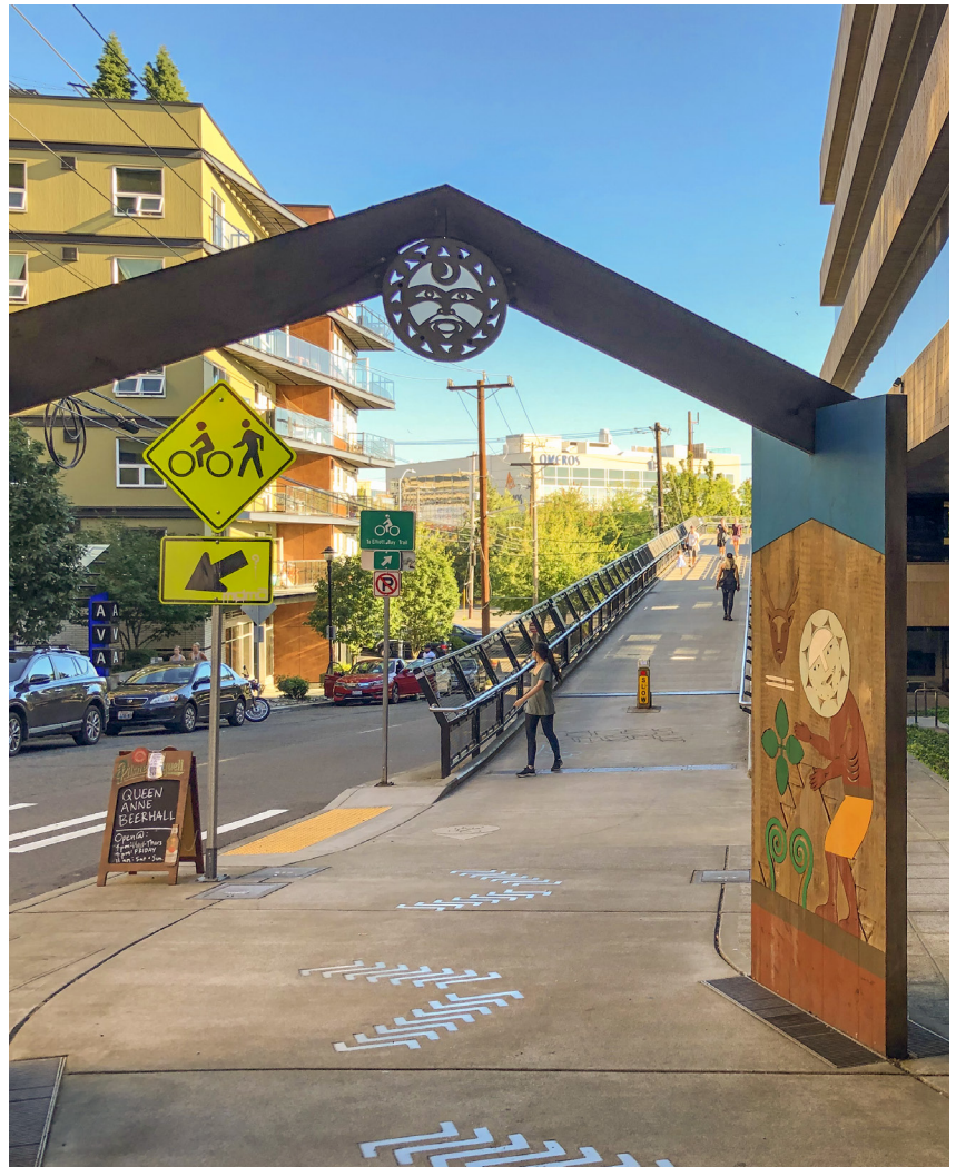
View of Thomas Street Overpass from 3rd Ave W looking southwest.

This report summarizes the outreach activities that SDOT conducted throughout the design phases and outlines how public input has informed the final design of the Seattle Center to Waterfront Walking and Biking Connection.