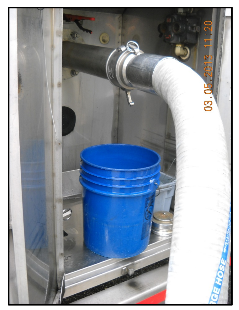
Figure 8. Temporary Containment Device Placed Under a Hose Connection.

The following BMPs or equivalent measures are required in areas of transfer from tanker trucks and railcars to aboveground or underground storage tanks: