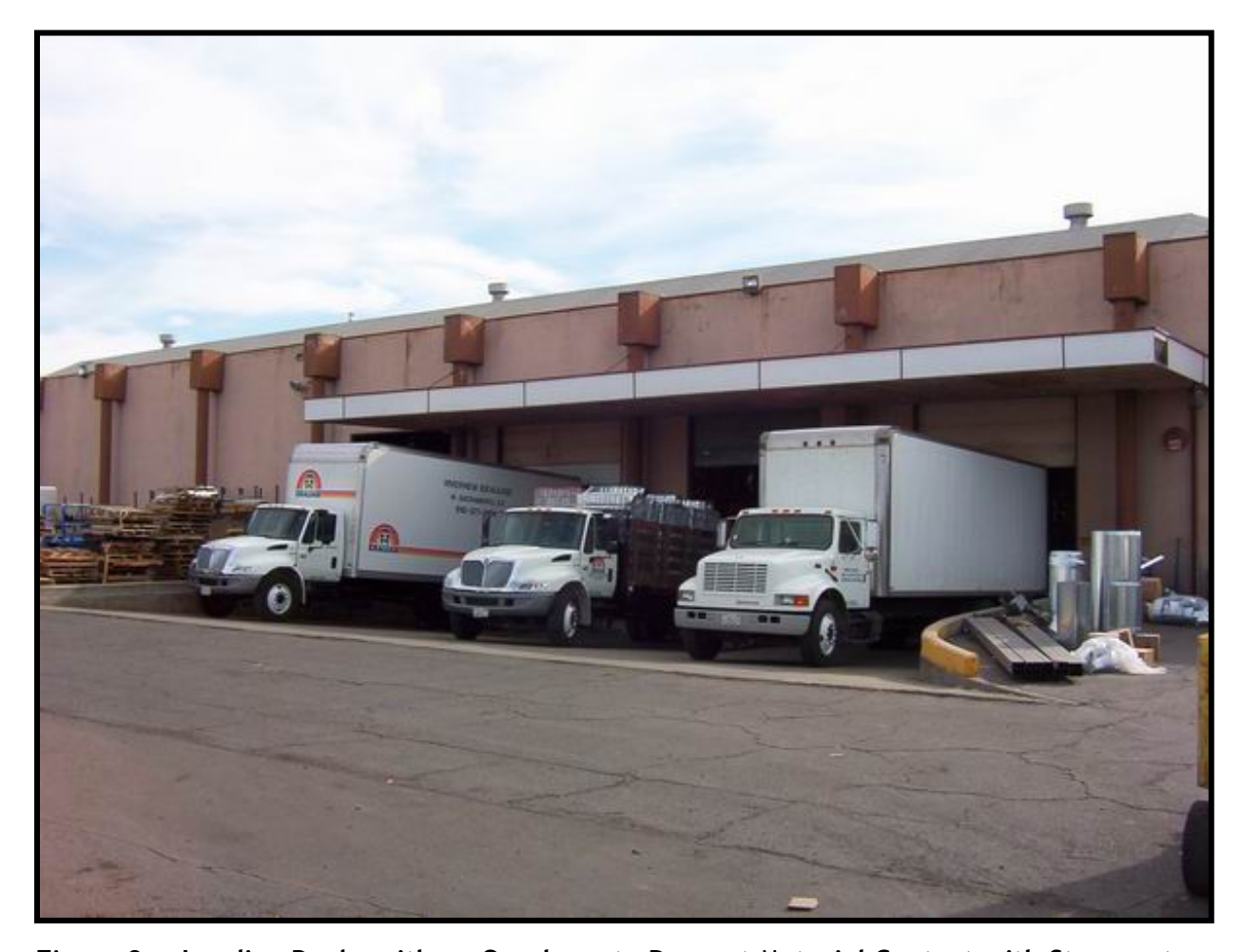
Figure 9. Loading Docks with an Overhang to Prevent Material Contact with Stormwater.