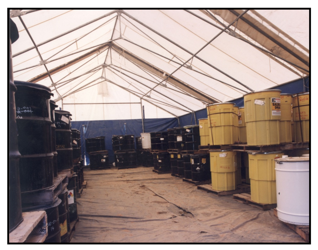
Figure 13. Covered and Secured Storage Area for Containers.