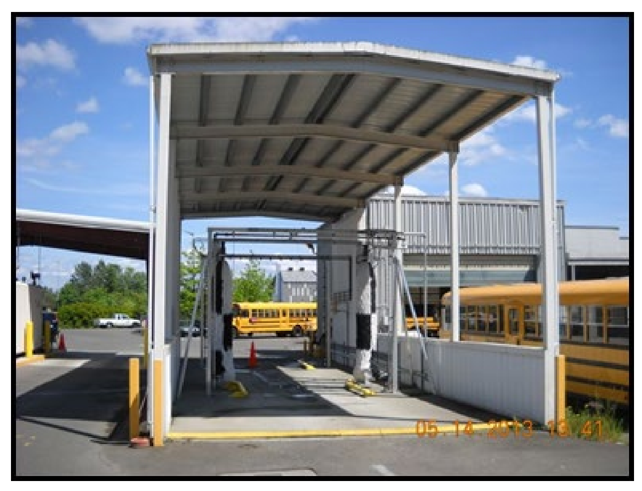
Figure 6. Car Wash Building with Drain to the Sanitary Sewer.

• The uncovered portion of the wash pad must be no larger than 200 square feet or must have an overhanging roof (refer to Figure 6). This is to prevent excess stormwater from entering the sanitary sewer. Covering may be required in many situations.