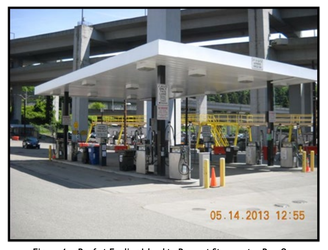
Figure 4. Roof at Fueling Island to Prevent Stormwater Run-On.