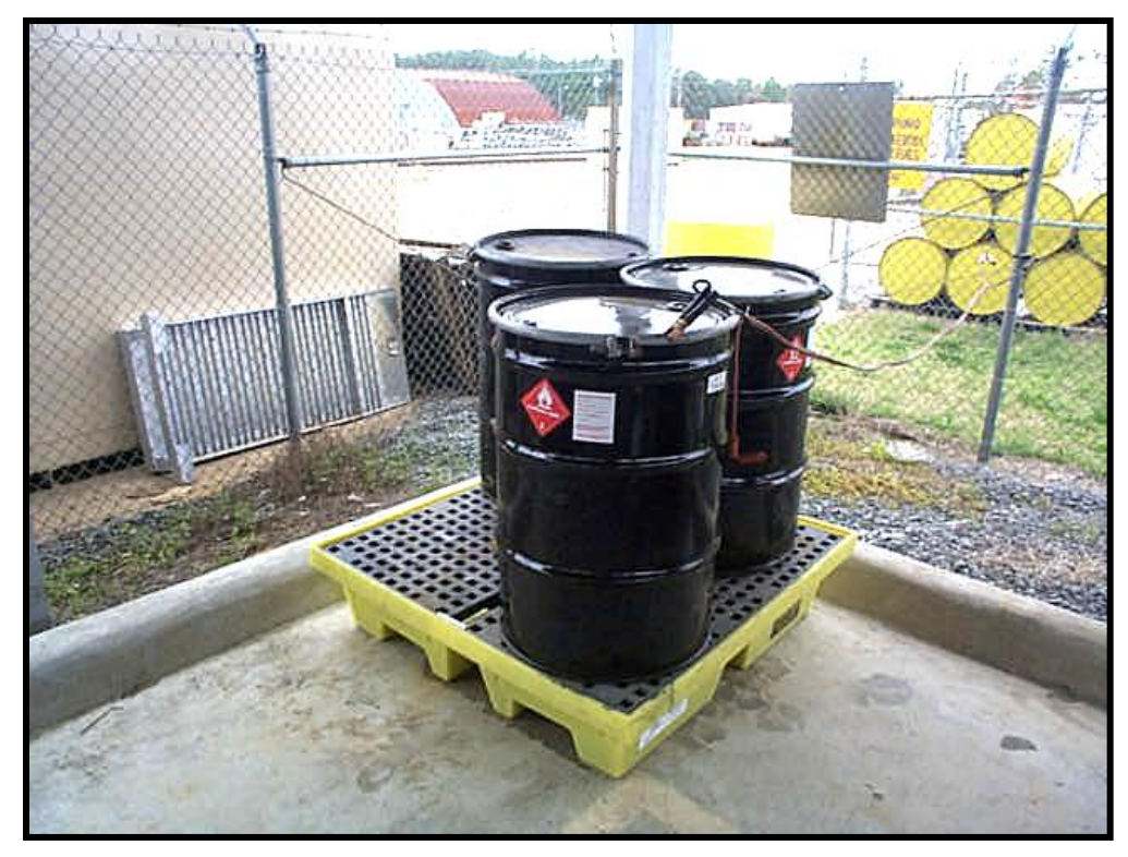
Figure 14. Containers Surrounded by a Berm in an Enclosed Area.