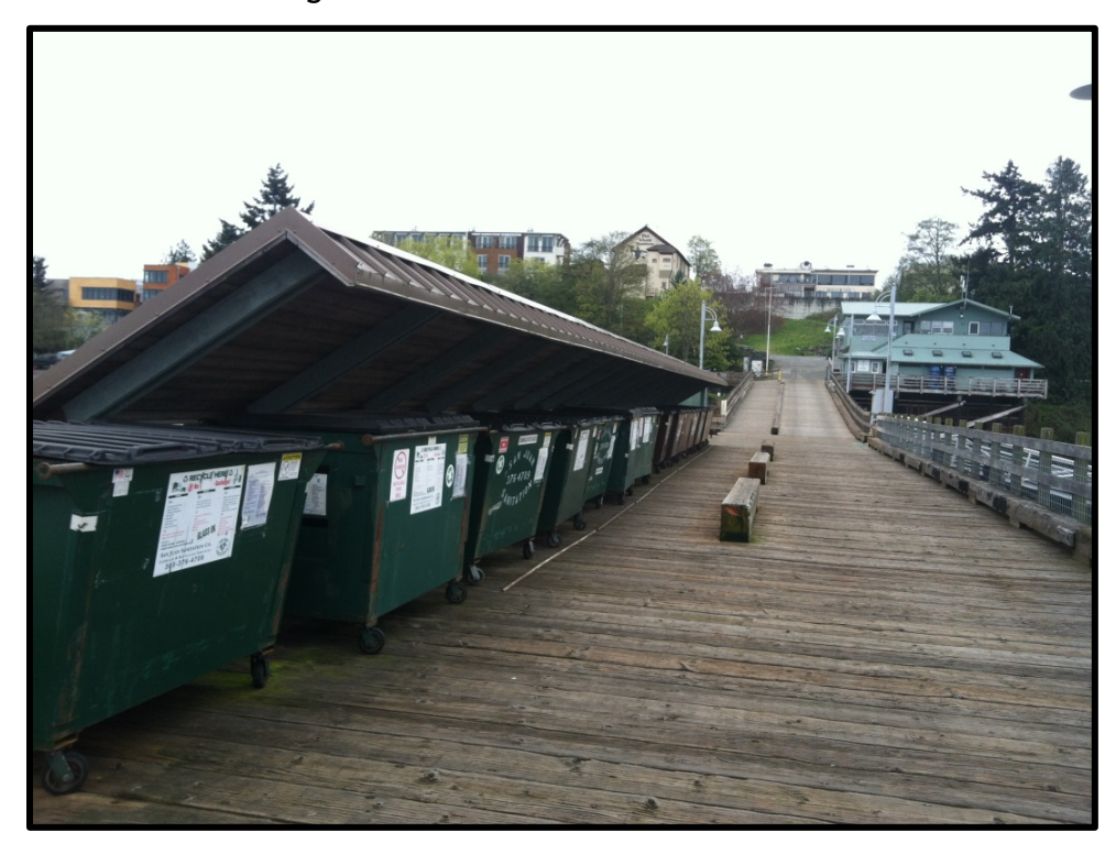
Figure 1. Covered Outdoor Storage of Solid Wastes.

• Store all solid wastes in suitable containers (Figure 1). Check storage containers and trash compactors for damage and replace them if they are leaking, corroded, or otherwise deteriorating.