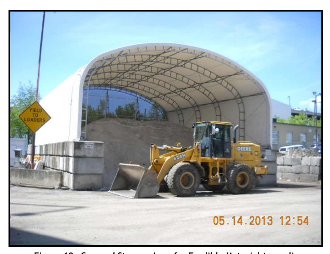
Figure 12. Covered Storage Area for Erodible Material (gravel).