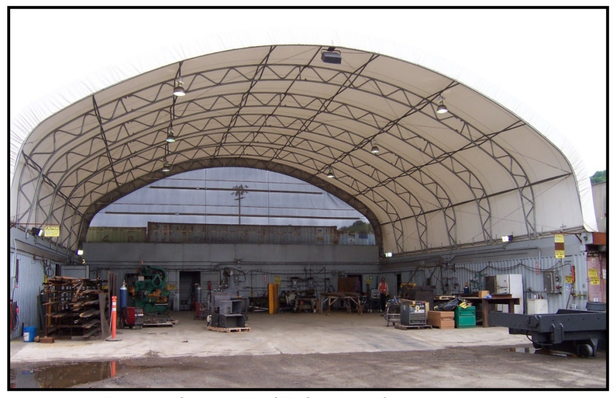
Figure 10. Structure Used To Cover Manufacturing Activities.

• Consider modifying the activity to eliminate or minimize the contamination of stormwater.