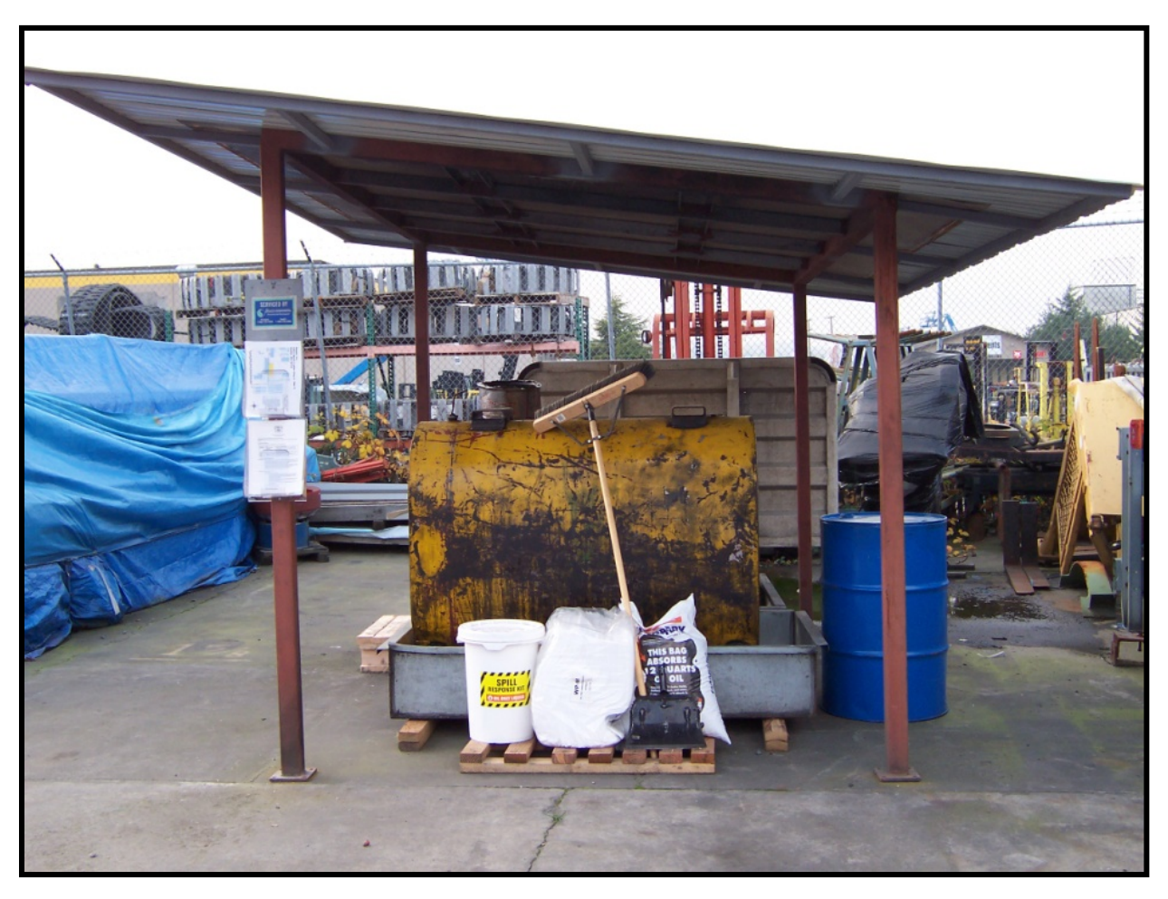
Figure 2. Waste Storage Area with Spill Kit and Posted Spill Plan.