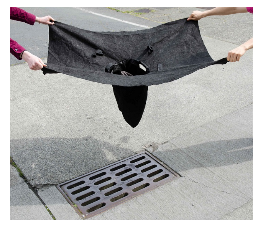
Figure 5. Commercially Available Catch Basin Filter Sock.

Sweep the production and pouring area, driveways, gutters, and all other outdoor areas daily or more often as necessary to collect fine particles and aggregate for recycling or proper disposal.