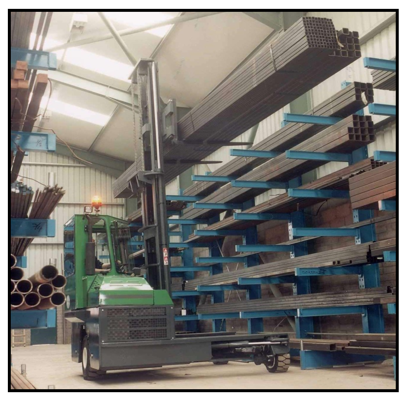
Figure 11. Covered and Secured Storage Area for Bulk Solids.