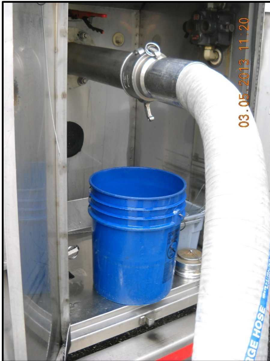
Figure 5. Temporary Containment Device Placed Under a Hose Connection.

Consistent with the requirements of this volume of the Seattle Stormwater Manual and the Seattle Fire Code (SMC, Chapter 22.600) and to the extent practical, unload and load solids and liquids in a manufacturing building or under a roof, lean-to, or other appropriate cover.