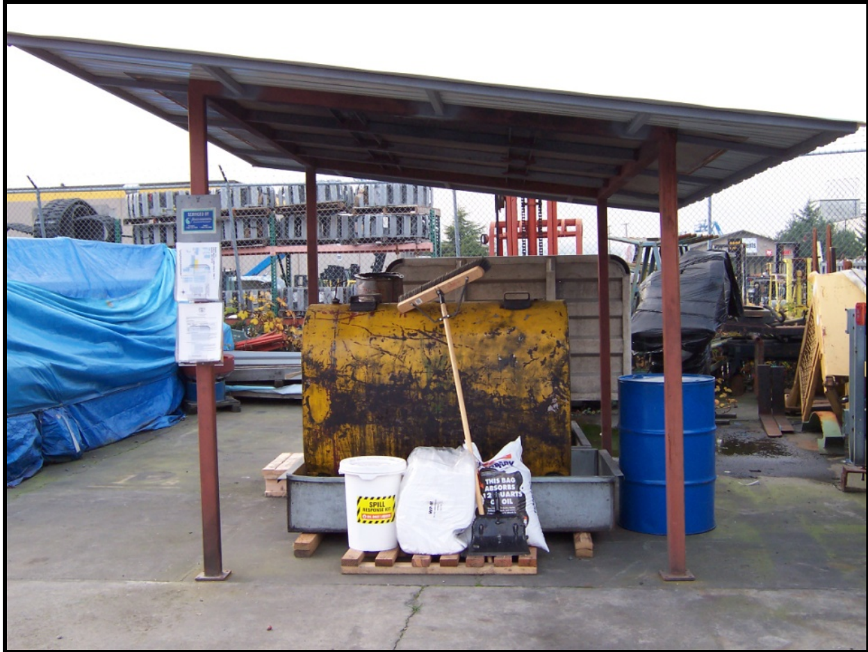
Figure 2. Waste Storage Area with Spill Kit and Posted Spill Plan.