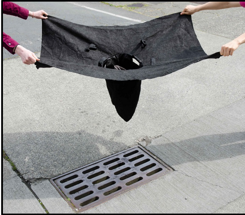
Figure 9. Commercially Available Catch Basin Filter Sock.