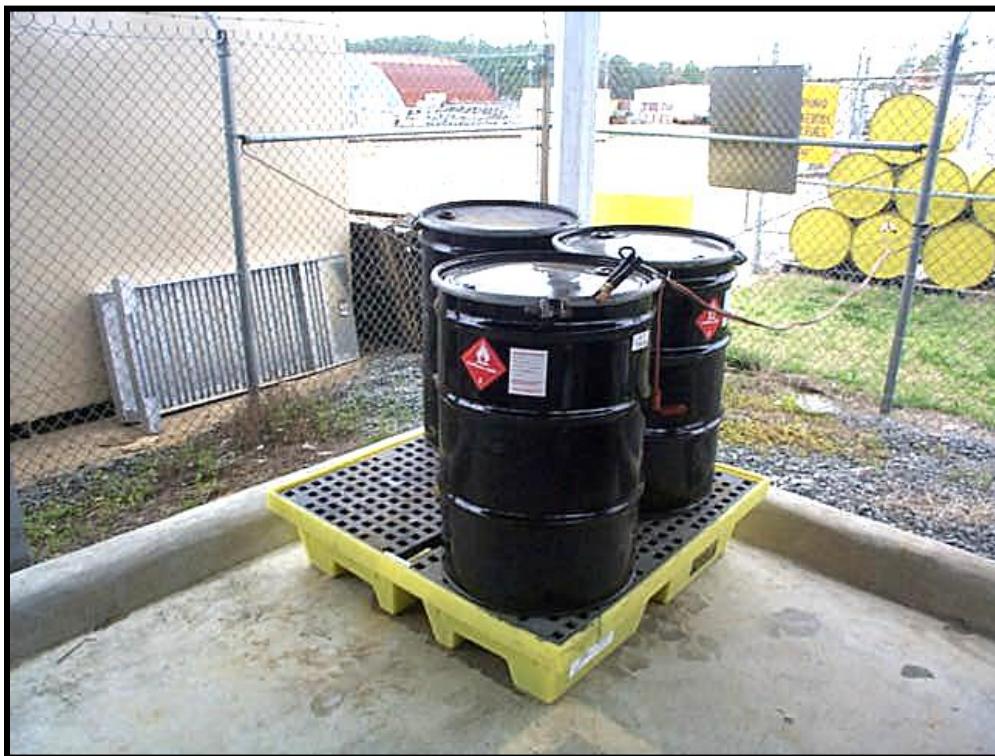
Figure 14. Containers Surrounded by a Berm in an Enclosed Area.