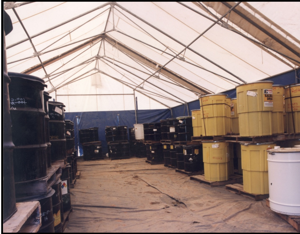
Figure 13. Covered and Secured Storage Area for Containers.