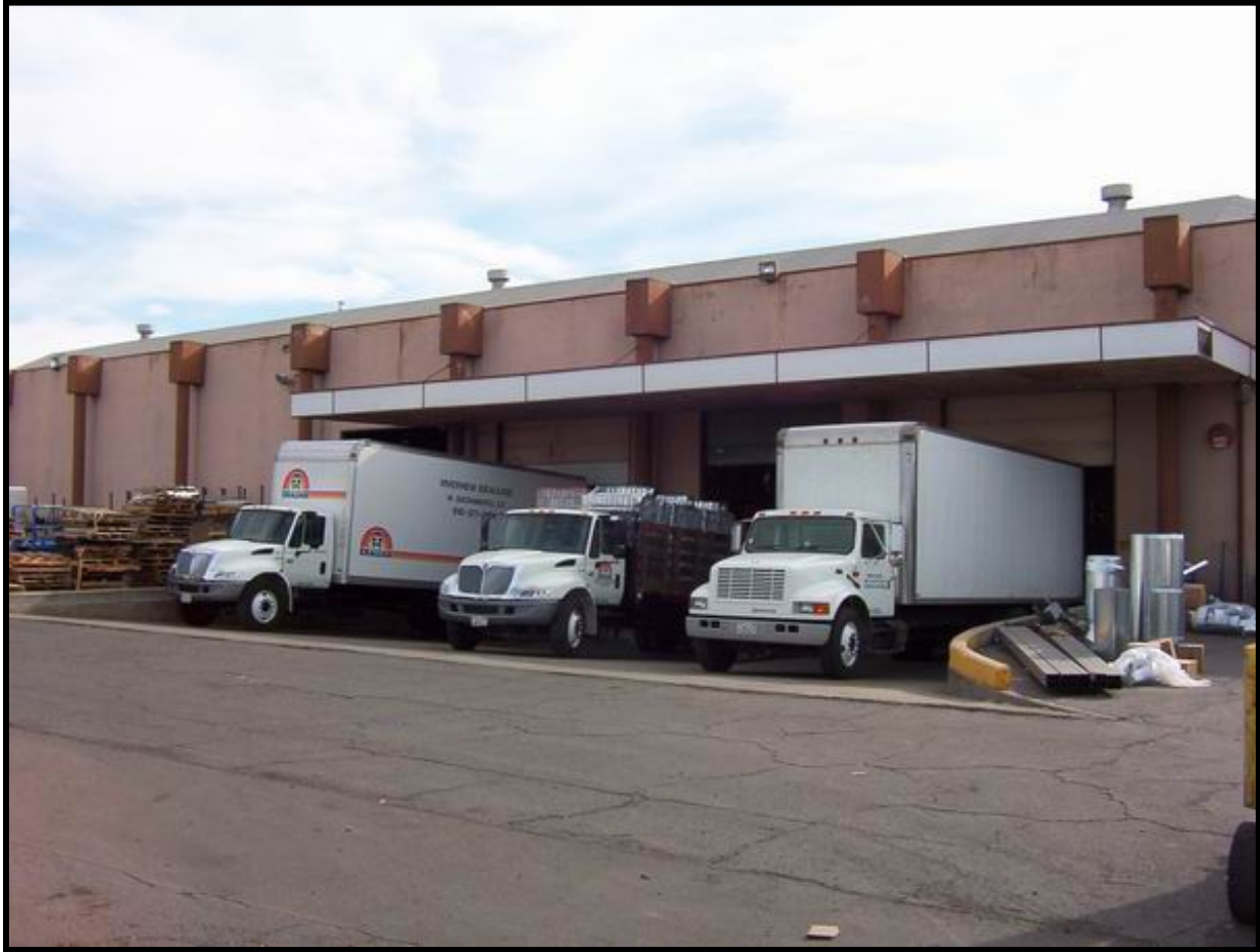
Figure 6. Loading Docks with an Overhang to Prevent Material Contact with Stormwater.

BMP 10 ( Section 3.2.2 ) is recommended in areas of transfer from tanker trucks to aboveground or underground storage tanks, and includes: