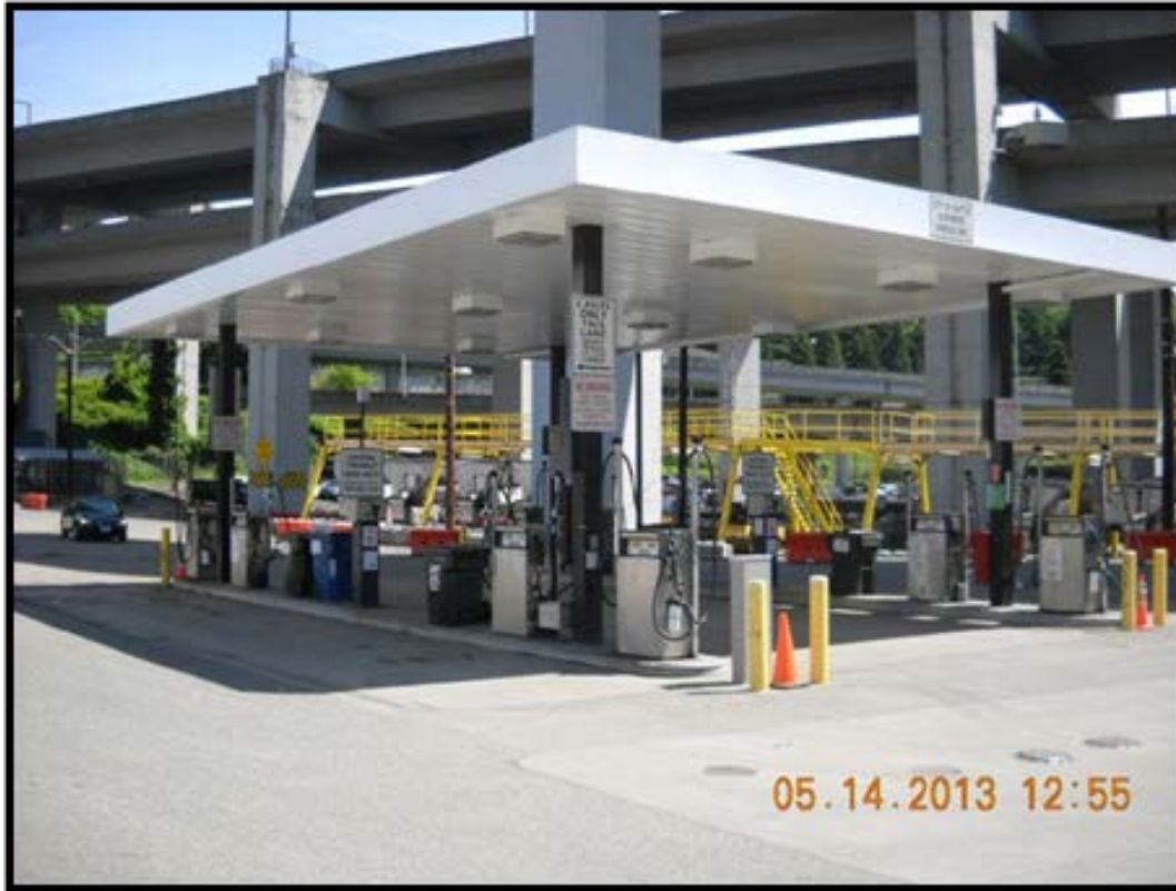
Figure 8. Roof at Fueling Island to Prevent Stormwater Run-on.