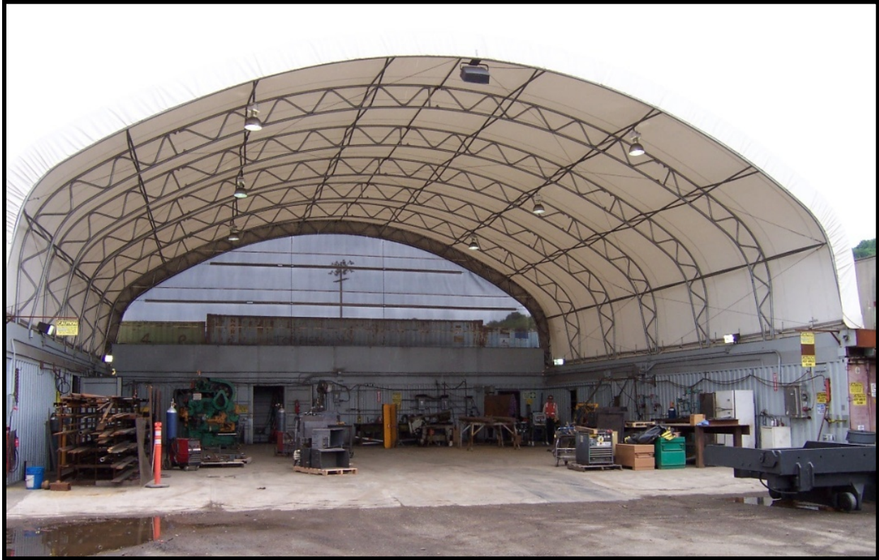
Figure 10. Structure Used To Cover Manufacturing Activities.