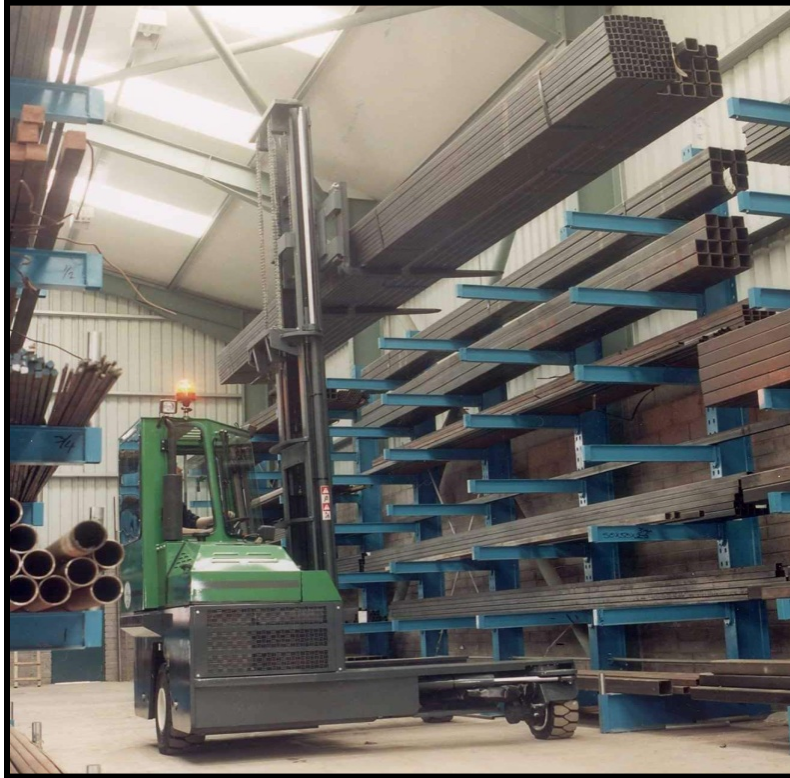
Figure 11. Covered and Secured Storage Area for Bulk Solids.