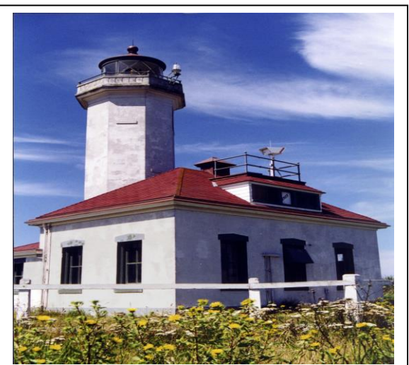
The Dungeness Lighthouse, located at the tip of Dungeness Spit near Port Angeles, Wash., was the first American Lighthouse in Puget Sound. The lighthouse was established in 1857 and automated in October 1976.

The aids to navigation depicted on charts comprise a system of fixed and floating aids that have varying degrees of reliability. Therefore, prudent mariners will not rely solely on any single aid to navigation, particularly a floating aid. With respect to buoys, the buoy symbol is used to indicate the approximate position of the buoy body and sinker, which secures the buoy to the seabed. The approximate position is used because of practical limitations in positioning and maintaining buoys and their sinkers in precise geographical locations. These limitations include, but are not limited to, inherent