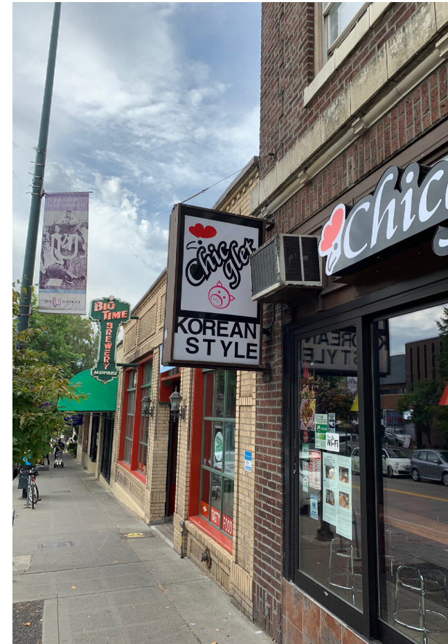
Concentration of small, locally-owned businesses. Some consider conserving existing buildings to be a method to reduce the likelihood of losing existing small businesses.

Do you like this suggestion? What comments do you have about it?