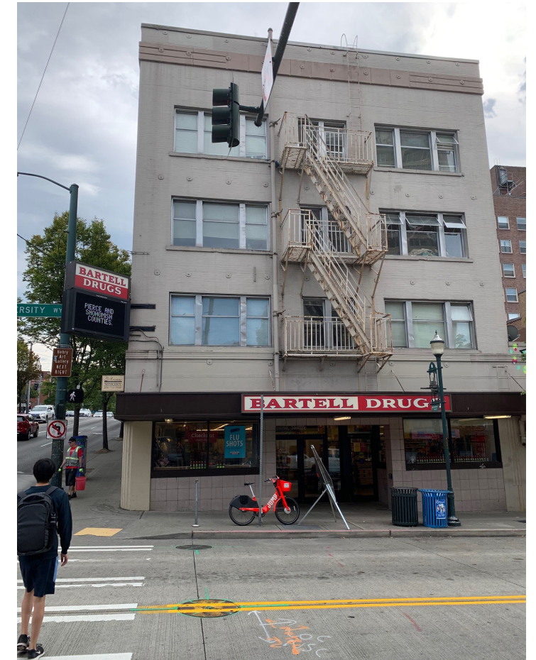
Historic-aged retail and mixed-use buildings range from one story to six stories, some with lower-cost living spaces on upper floors.