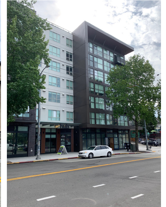
A recently constructed 6 story building on the Ave. at NE 50th St., built under existing zoning.