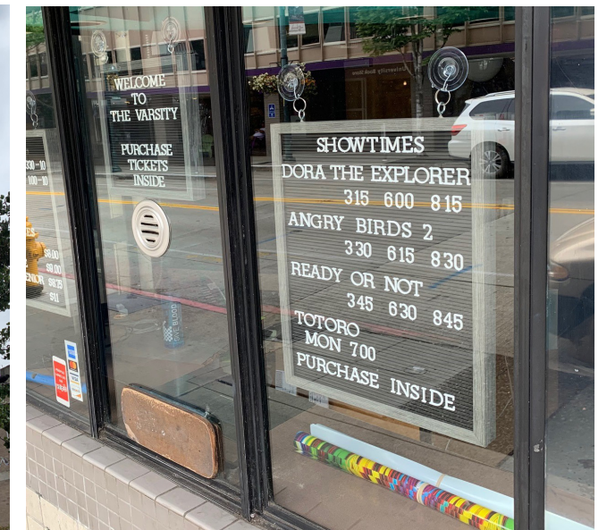
The Ave hosts cultural and bohemian establishments such as the Varsity and Grand Illusion Theatres and Bull Dog News.