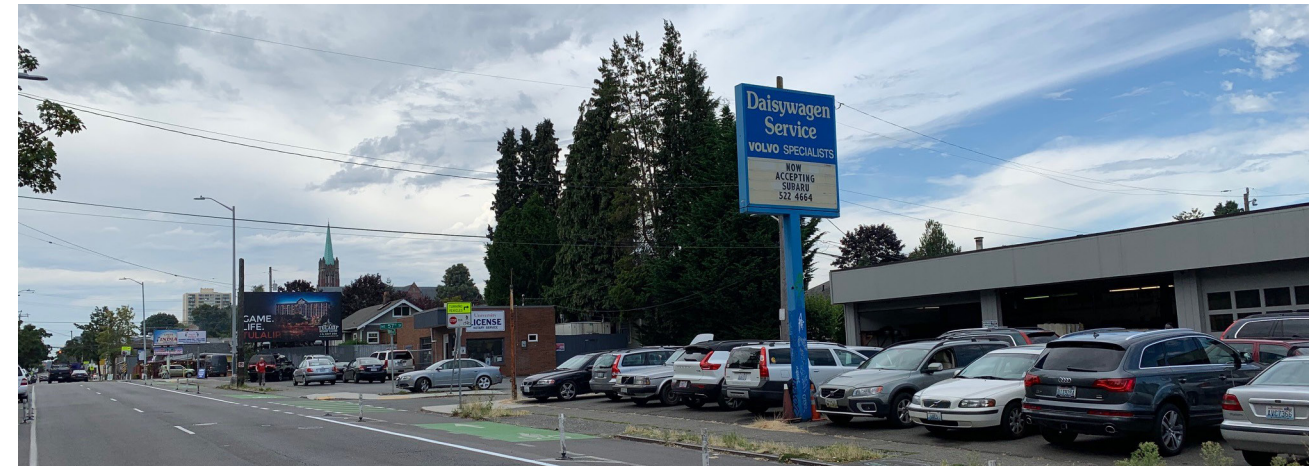
Low scale, including autorepair shops on Roosevelt Way NE.