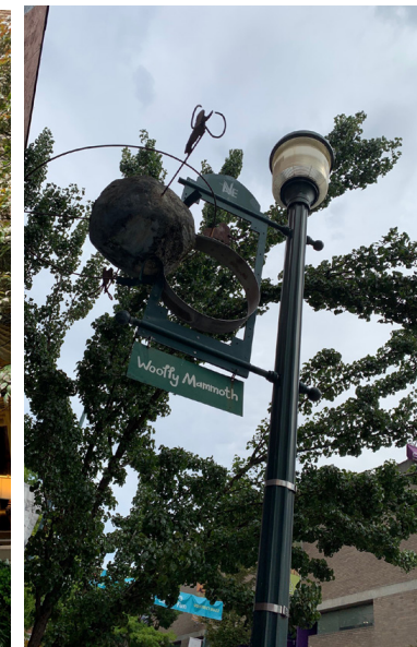
University District branded streetscape improvements from the early 2000's would coincide with the Conservation area.