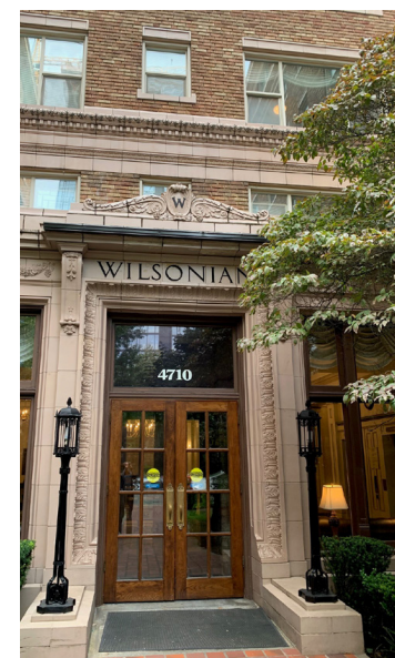
The Wilsonian apartments provides well-maintained market rate housing on the Ave. with rents from $1,500/month for a studio.