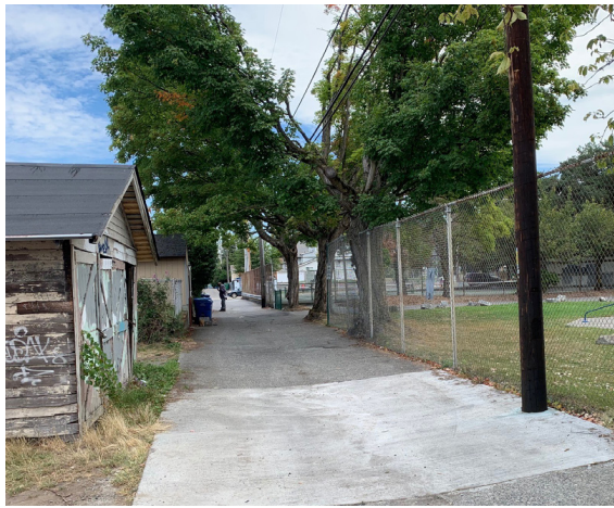
Some edges of the park are not activated, and do not have oversight.