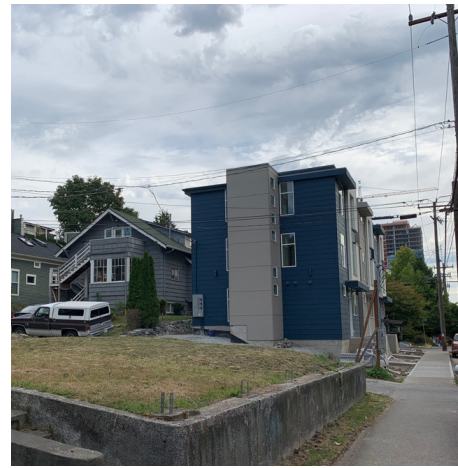
Townhouse development is occurring under existing zoning.