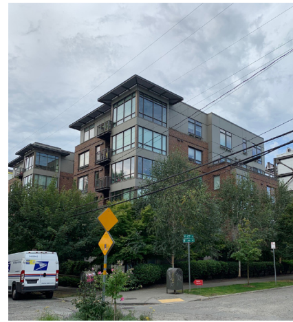
Changing the zoning to MR would allow new housing similar to the area directly across NE 47th St.