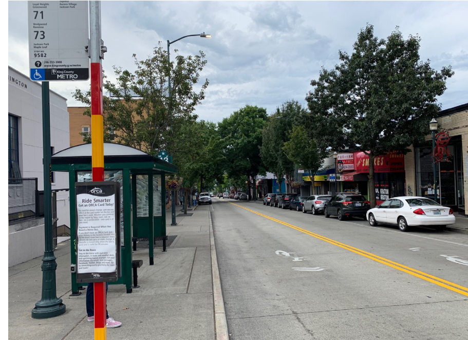
Existing conditions on the Ave. looking south at the Post Office.