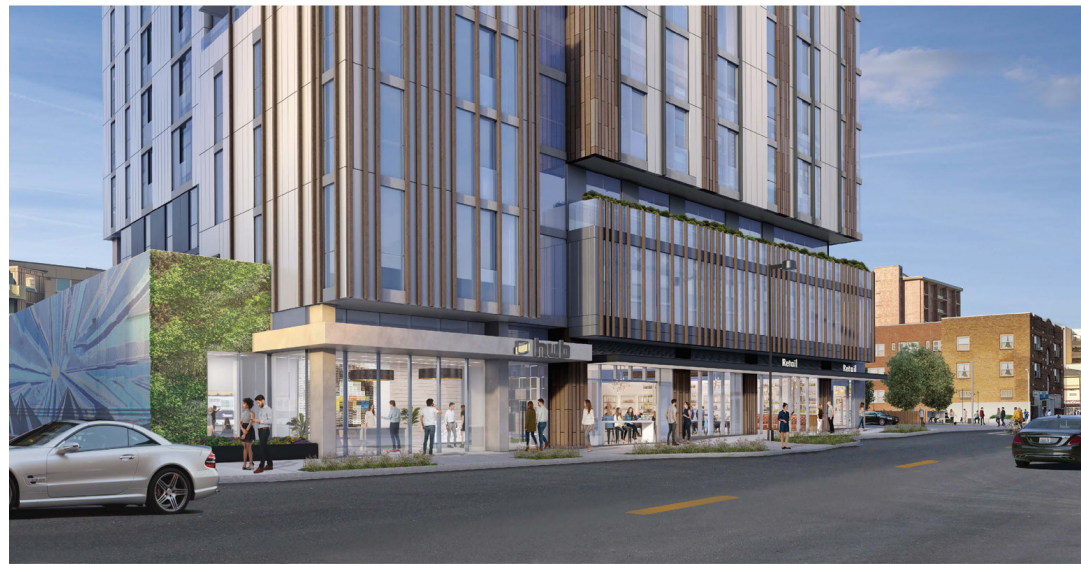
HUB U District, Brooklyn | 4515 / 4525 Brooklyn Ave NE, Seattle WA 98105 Recommendation Meeting | 3032065-EG | 302149-EG | 04.15.19 73

The Hub is a proposal in the permitting process within the 320' zone, at 4515 Brooklyn Ave. NE. The proposed building would top out at 265'.