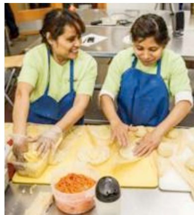
La Cocina, San Francisco CA

The first generation of shared-use food facilities - those in existence prior to 2008 – were primarily kitchen incubators and were either small individual kitchens, or larger-scale initiatives undertaken by universities. A number of the first generation incubators closed down because they were unsustainable, for one reason or another. However, several key early adopters remain open for business and provide some valuable lessons on what works. Examples include incubators such as La Cocina in San Francisco, Commonwealth Kitchen (formerly Crop Circle Kitchen) in Boston, ACEnet in Columbus Ohio and the Food Technology Center at University of Idaho.