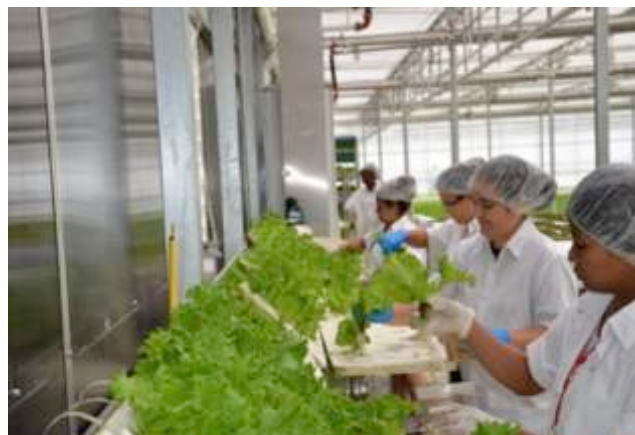
Employees at Green City Growers

The latest business, Green City Growers, launched in 2012 and features a 3.25 hydroponic greenhouse that grows pesticide-free produce year-round. Green City Growers has 31 employees and distributes to grocery stores, foodservice companies, restaurants and major institutions within a 150-mile radius of Cleveland. Green City Grower's institutional buyers are Case Western University, Cleveland Clinic, and University Hospitals; their retail clients include the regional grocery chains Kroger and Meijer. Sysco, a well-known national distributor, is among Green City Grower's wholesale distributor network.