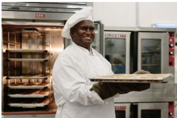
The "Harlem Pie Man": Tenant in HBK Incubates

Hot Bread Kitchen serves as the anchor business in La Marqueta. Hot Bread Kitchen's two programs include the Bakers in Training program and HBK Incubates. The Bakers in Training program is a workforce development program; a paid training program in artisan bread baking that serves low-income, minority, and immigrant women. This program prepares women to begin their own culinary careers or food businesses. In addition to learning bread baking, this program provides additional classes, such as baker's Math, Science, job readiness, and English as a second language. After completion of the program, Hot Bread Kitchen helps place them in full time jobs with benefits.