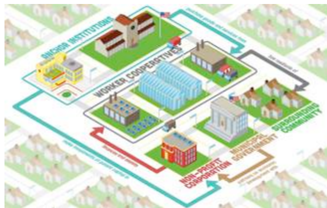
The Cleveland Model

The investment in, and presence of, a concentration of nineteen anchor institutions was in stark contrast relative to the conditions of the University Circle community in which these institutions were located. The socioeconomic divide was apparent in the juxtaposition of some of the city's most valuable cultural assets and the disinvested community in which they existed; this was the driving force for creating a plan to mitigate those disparities.