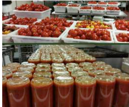
Product from CWK

The Contract Manufacturing Social Enterprise provides small-batch contract manufacturing labor and cold and frozen warehousing for members, local farmers, and other food producers. CWK works with wholesalers, retailers, restaurants, caterers, and local farms to prepare and turn their recipes and ingredients into a pre-packaged value-added product. CWK works with culinary training programs to hire its graduates to work for its contract-manufacturing program, where graduates learn transferrable manufacturing skills.