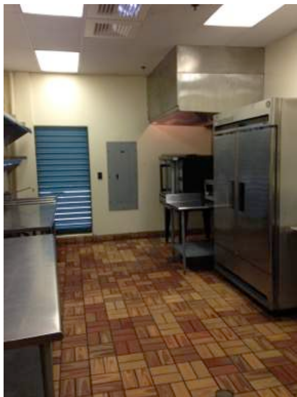
Typical Rentable Kitchen Space

PGC’s Culinary Kitchen Incubator has twelve certified commercial kitchens.