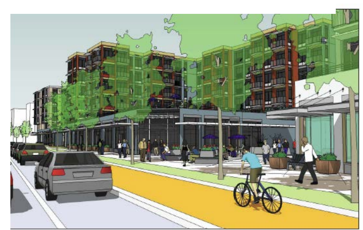
Netail along Linden Ave. N and clustered around a courtyard that is a gathering space and, by connecting through o the east side, links the Village Center to development facing Aurora.

• Residences on upper floors Relationship of Development to Street