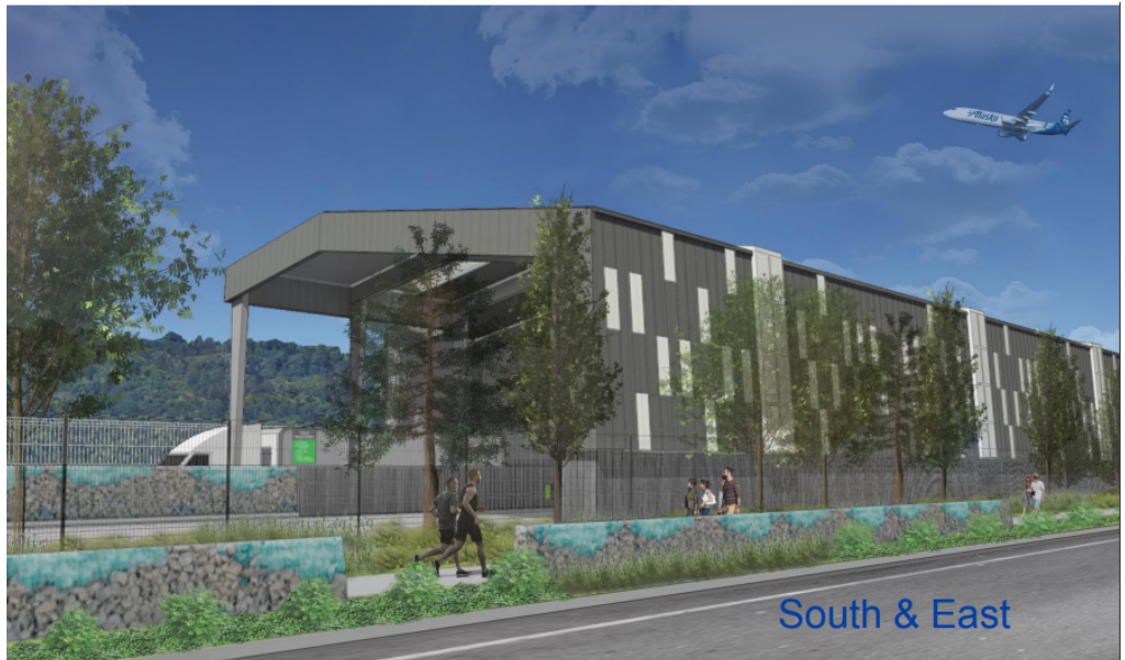
Figure 5: rendering of building facade and proposed art