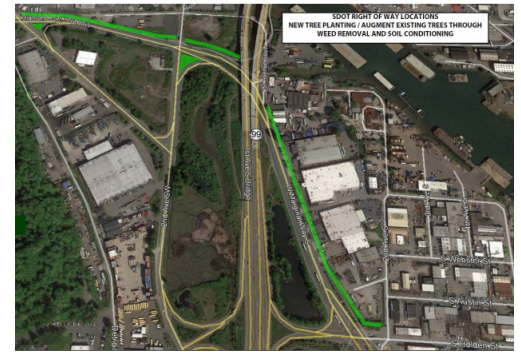
New and Rehabilitated Street Trees in South Park adjacent to sidewalks and trails