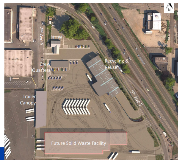
Figure 2: Updated site plan