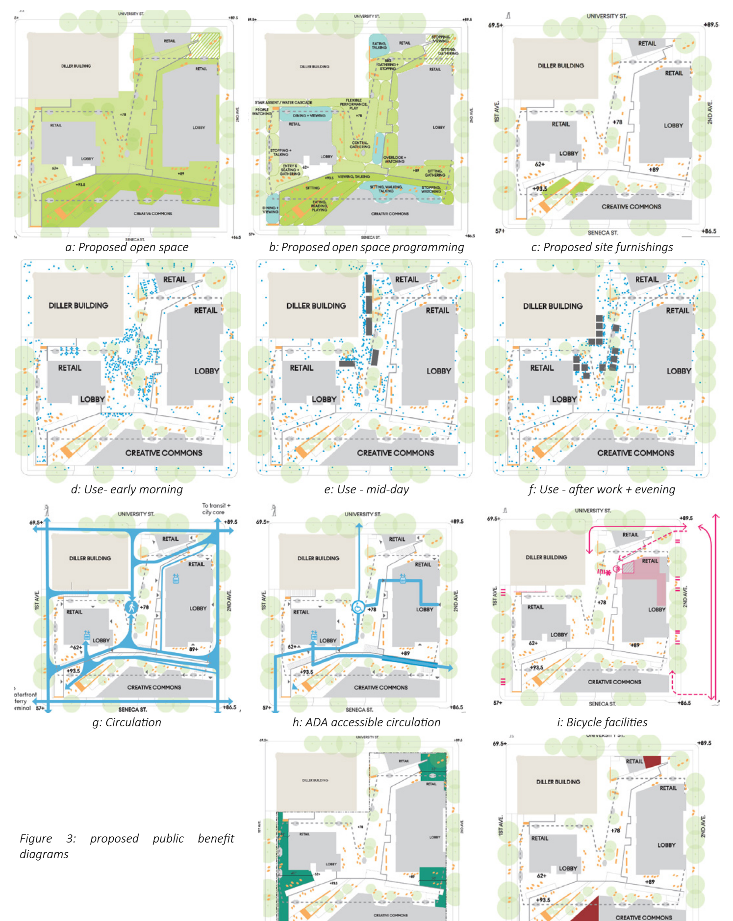
j: Voluntary building setbacks