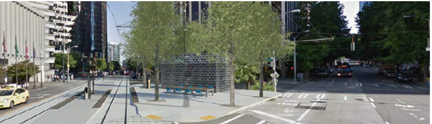
Figure 4: Rendering of "screen" concept for the TPSS