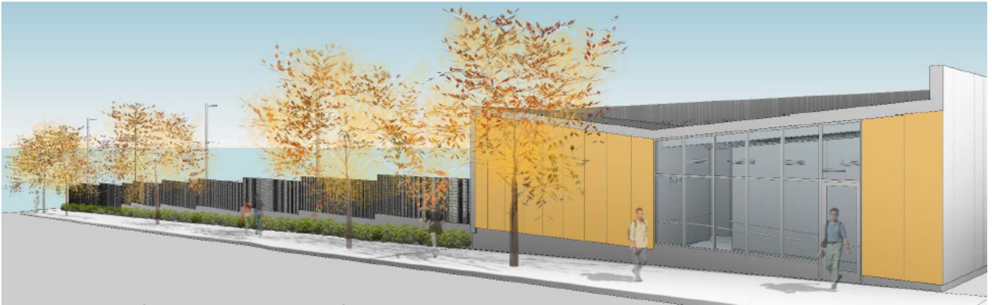
Figure 3: Rendering of operations and maintenance facility annex