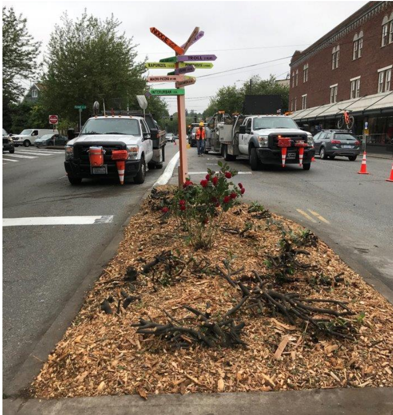
Center of the Universe gets spruced up by SDOT crews.