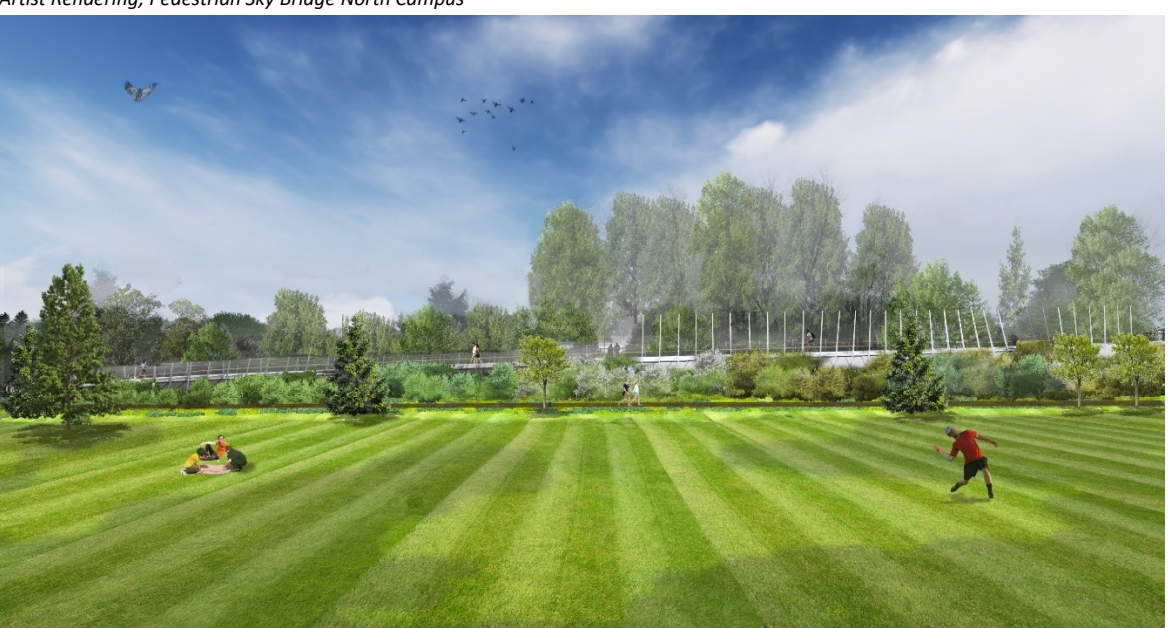
Artist Rendering; Pedestrian Sky Bridge North Campus

NSC has not implemented this program element due to lack of funding. Bus route #26 provides a connection to the campus and the Pedestrian Skybridge will meet this need Fall of 2021.