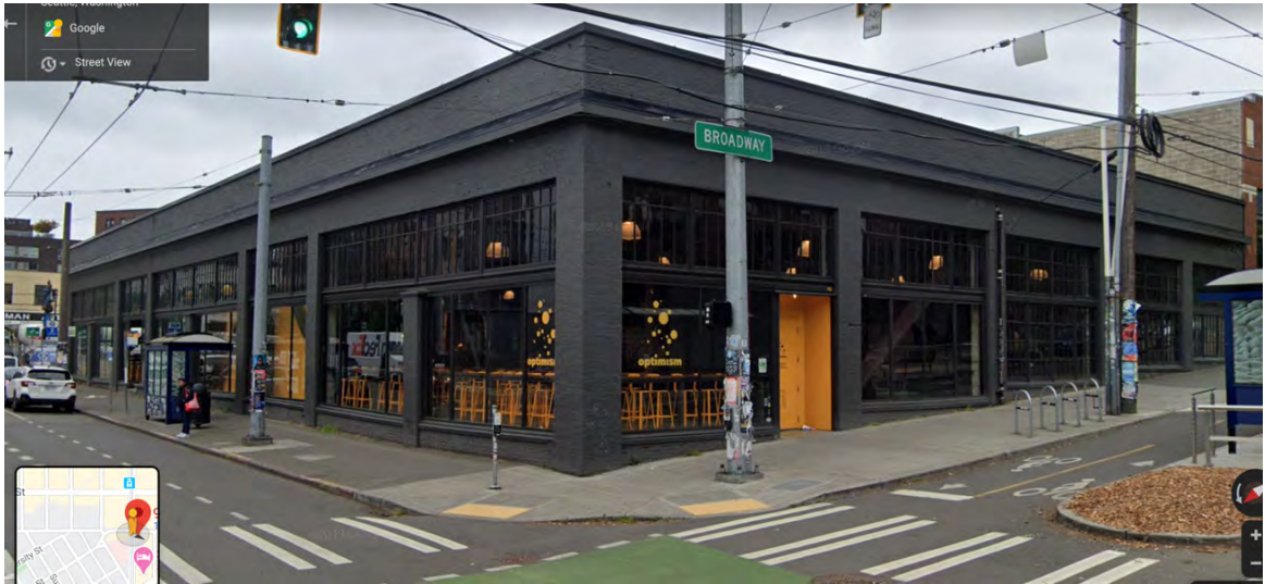
Great Western Motors (1920), 905 E. Union Street, now Optimism Brewing. Also designed by Voorhees.