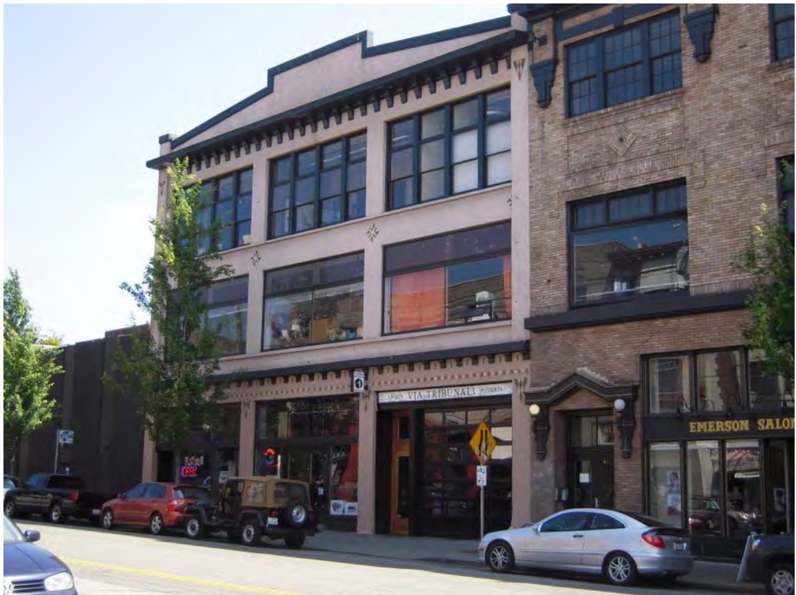
Graham Motor Cars (1912), 915 E. Pike Street. Also designed by Voorhees; cited as potentially eligible in Neighborhood Commercial Districts context statement. (DON, 2010)