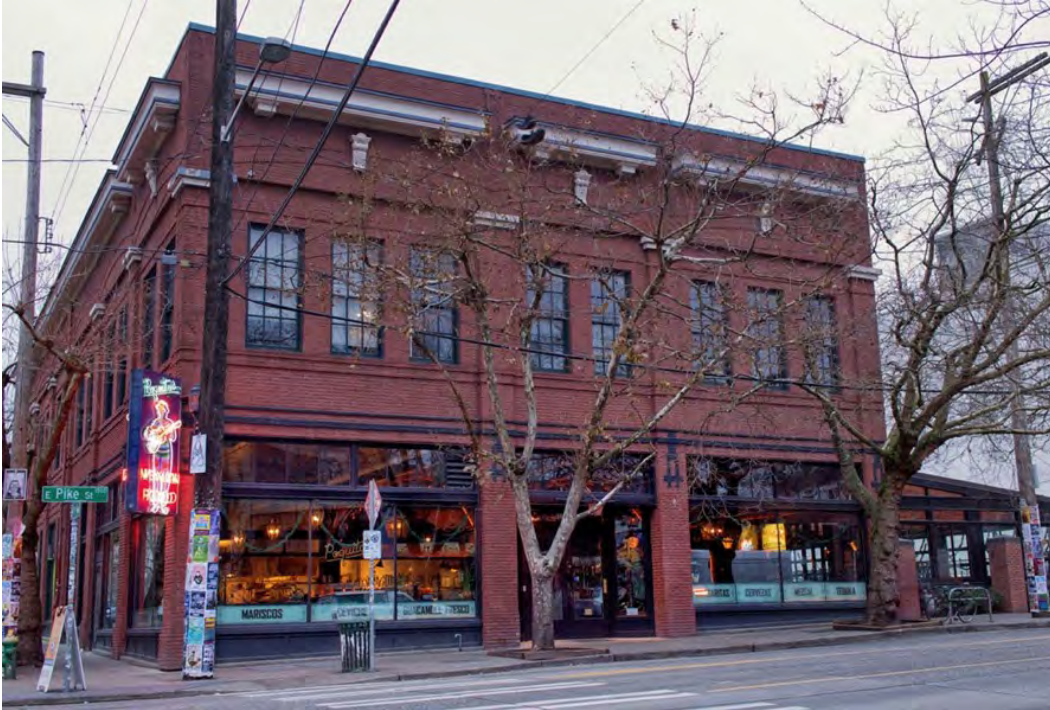
Seattle Automobile Company (1912), 1000 E. Pike. Cited as potentially eligible in Sound Transit EIS. (Hunters Capital, 2014)