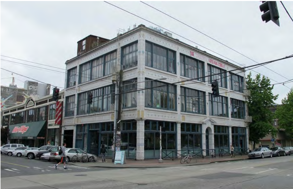
White Motor Company/Colyear Auto Sales, later occupied by REI (1918), 1021 E. Pine, now a Seattle landmark. (DON)