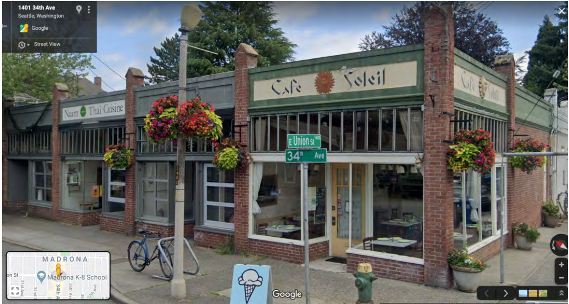
Neighborhood commercial building (1924), 1400 34th Ave. Also designed by Voorhees.