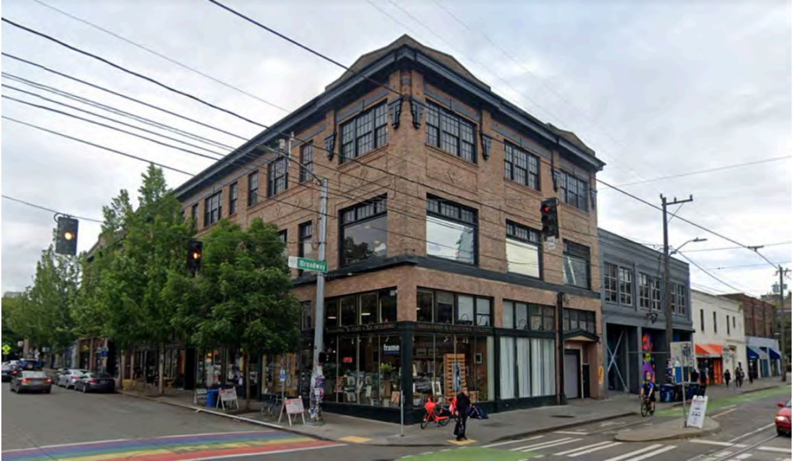
Tyson Automobile Company (1912), 903/905 E. Pike. Cited as potentially eligible in Neighborhood Commercial Districts context statement.