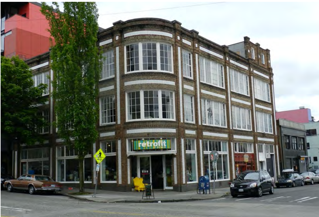
Liebeck Garage (1916), 1101 E. Pike. Cited as potentially eligible in Sound Transit EIS; currently under consideration as a Seattle landmark. (DON, 2011)