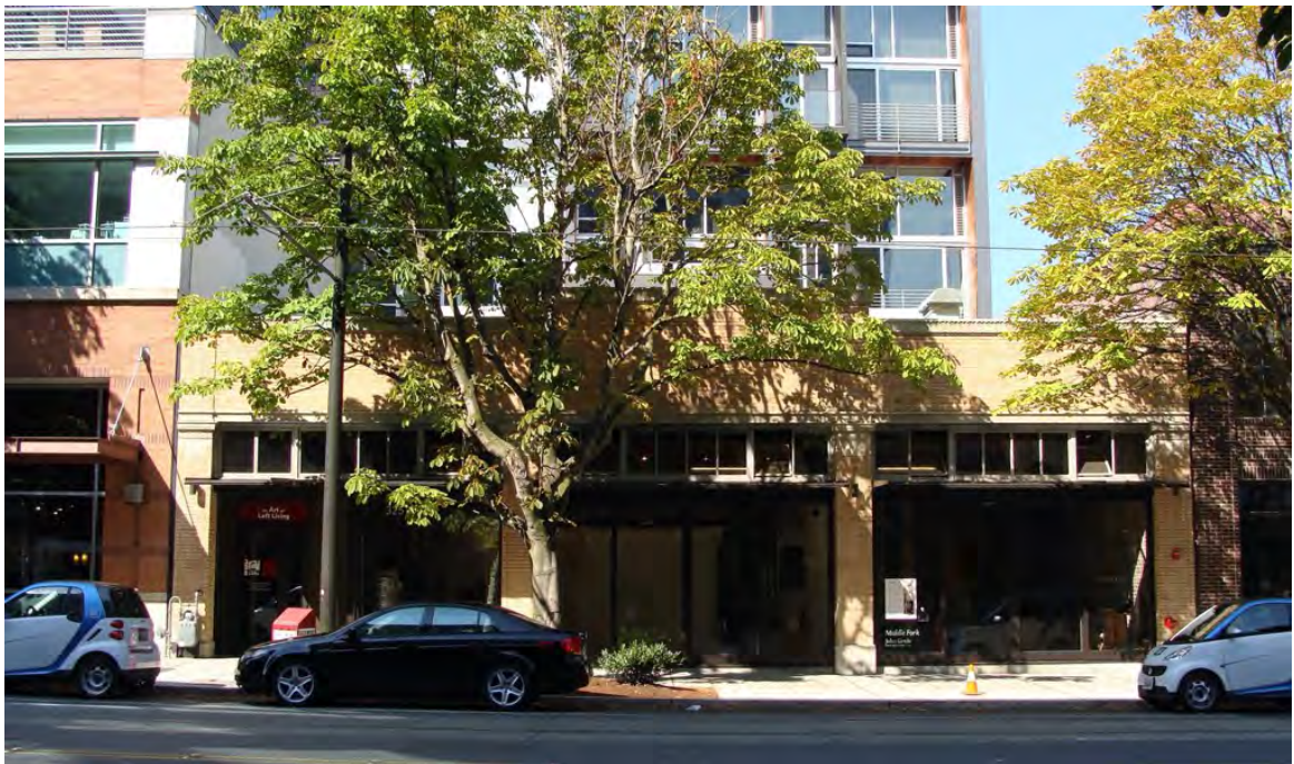
Nash Motors Co. (1927), 325 Westlake Ave N. Also designed by Voorhees. (DON, 2014)