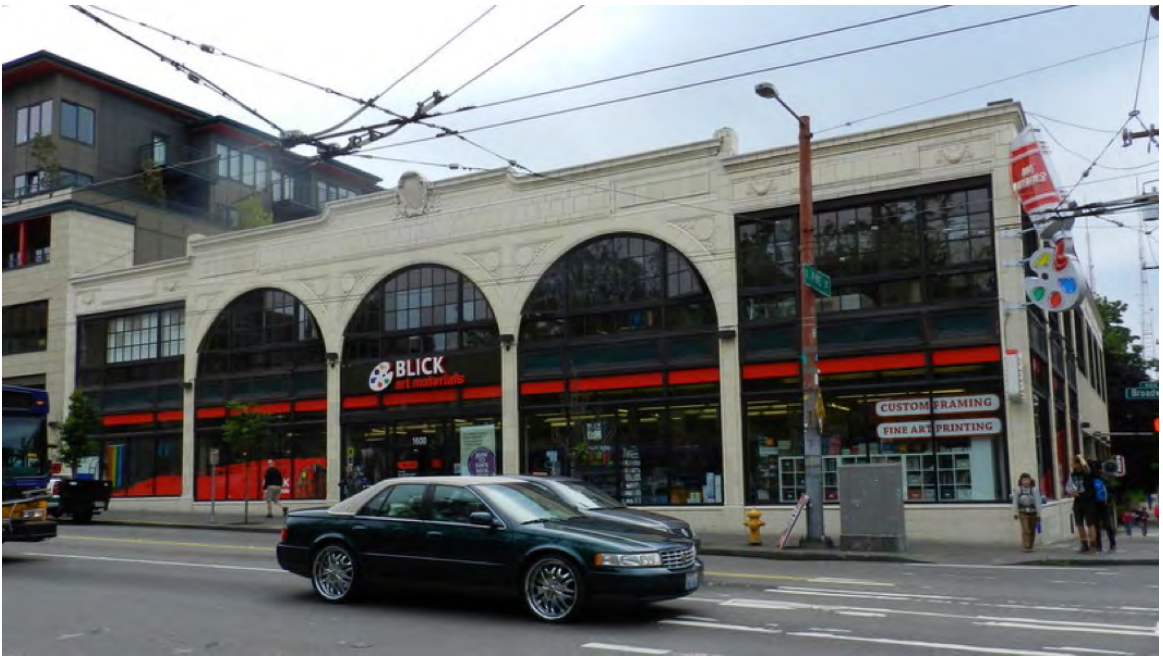
Packard dealership, later Pontiac (1925), 1600 Broadway, now Blick Art Materials. Cited as potentially eligible in Neighborhood Commercial Districts context statement. (DON, 2011)