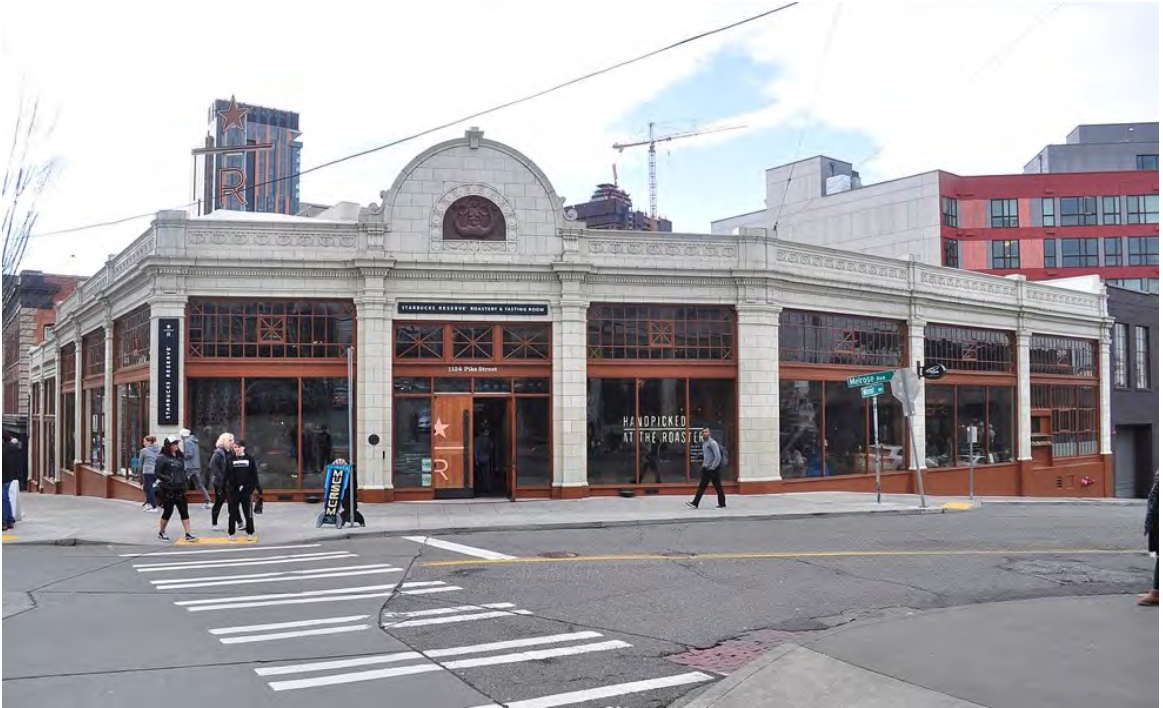
Packard dealership (1925), 1120/1124 Pike, now Starbucks Reserve Roastery. Cited as potentially eligible in Neighborhood Commercial Districts context statement.