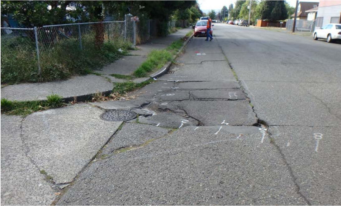
BEFORE September 2016

The sinkhole at Carleton Avenue S and S Eddy Street created issues for both public and private commuters in the Georgetown neighborhood. Seattle Public Utilities (SPU) and Seattle Department of Transportation (SDOT) employees worked together to repair the sinkhole by November 4.