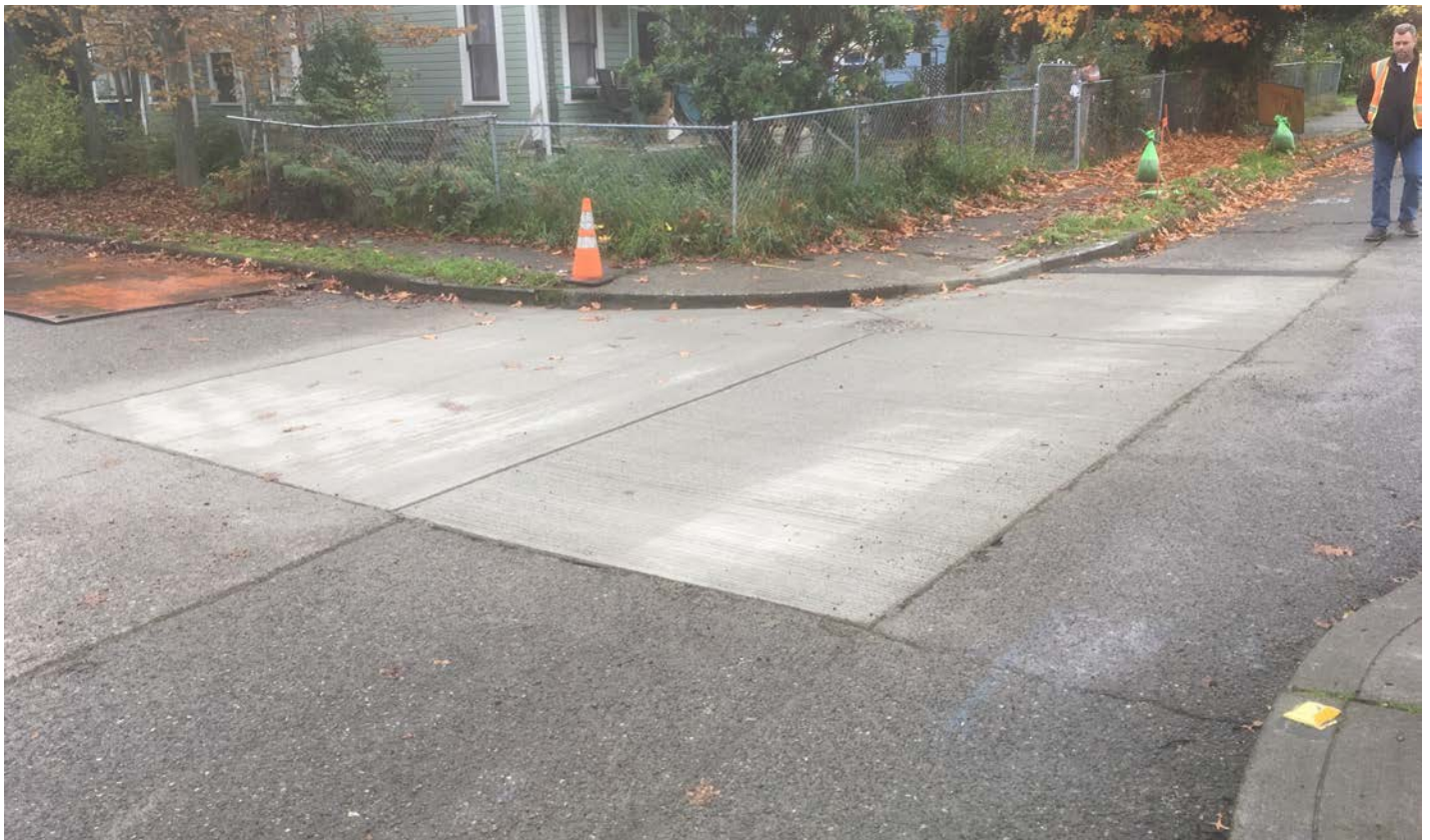
AFTER November 2016