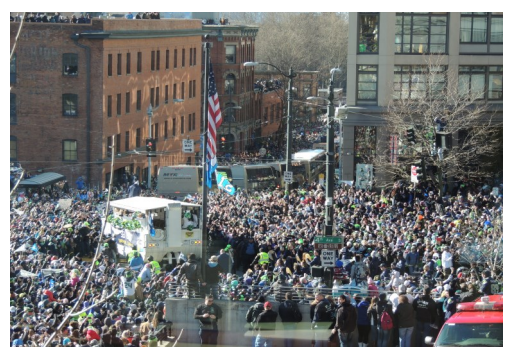
Seahawks Victory Parade

Three separate parts of the city's emergency management program were tested – and proven very proficient – this year. Of the seven activations of the Seattle Emergency Operations Center in 2014, perhaps the most notable was for the Seahawks Super Bowl Victory Parade in February. Anticipating a record-setting attendance for a downtown week-day event, the EOC hosted a close-knit team of subject matter experts in transportation, utilities, public safety, health and human services, public information, as well as Century Link and Seahawks organization representatives to address any issues that might arise.