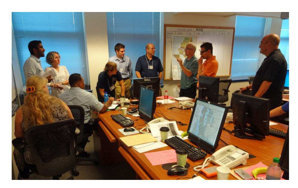
Members of the Disaster Management Committee exercise the Winter Weather Plan.