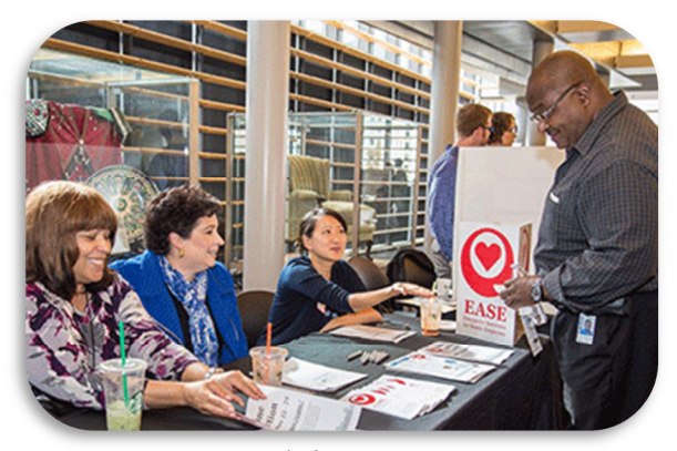
EASE attended the City's first Social Justice Equity Fair