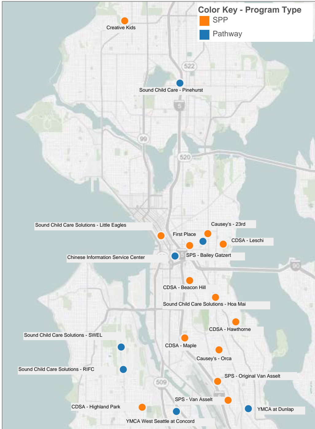
Figure 2: 2015-2016 SPP & SPP Pathway Classroom Sites

Note: Two SPP sites (Little Eagles and Hoa Mai) have more than one classroom.