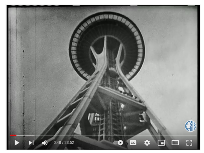
World of Tomorrow: Space Needle. Item 12803, Seattle Channel Moving Images (Series 3902-01), SMA.

One of the more popular additions to <u>SMA's YouTube channel</u> is a recently digitized recording of a live broadcast from the Space Needle observation tower, originally aired just prior to its official opening on April 21, 1962. At the time, the Space Needle was the tallest structure in Seattle and contained the world's highest revolving restaurant.