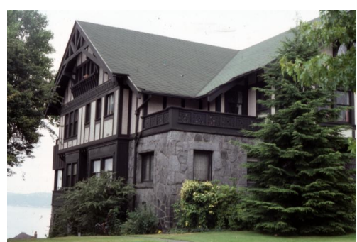
Stimson House -- 405 W. Highland Dr., circa 1970. Image 198682, Series 1629-01, SMA.

residences. Other buildings, including apartments such as the Chelsea, Donaphilita, Marqueen, Villa Castella, and the Aloha Terrace buildings, stand beside street scenes of daily life. Also shown are the King