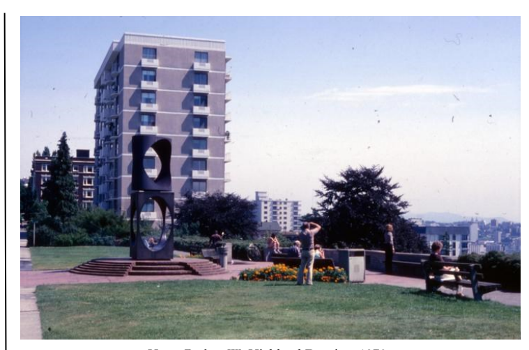
Kerry Park -- W. Highland Dr, circa 1970.