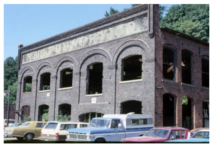
N&S Foundry, 1140 Elliott Ave West, circa 1970. <u>Image 199441</u>, Series 1629-01, SMA.

Recent additions to the Historic Building Survey Photograph collection come from Queen Anne. Midcentury images of the historic neighborhood show scenes of commercial districts, schools and playgrounds, streets, parks, residences, and multi-family buildings.