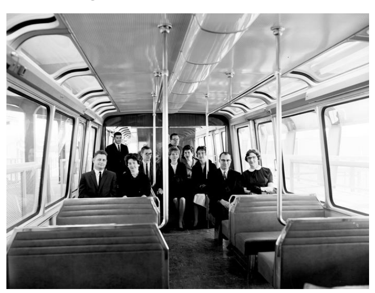
A group of people try out the interior of the new Seattle Monorail on March 20, 1962. The Monorail would open to the public a few days later on March 24. Image 165723, Series 1204-01, SMA.