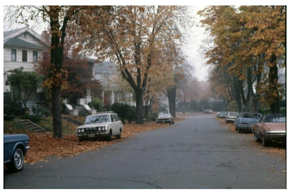
Queen Anne Boulevard, circa 1970.

County Hospital, the KOMO building, the Seattle Children's Home, and the Telephone Exchange. Iconic images of the TV towers long known to Queen Anne Hill, the Queen Anne Bowl, and Queen Anne Boulevard are also available in this wide ranging collection of Seattle's neighborhoods.