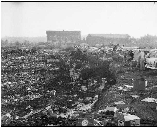
University Garbage Dump. Sunday Use. July, 1960 Item #65975, Engineering Department Photographic Negatives, Seattle Municipal Archives

Seattle garbage dump pictures are viewable online at The Seattle Municipal Archives Photograph Collection website by entering “garbage dumps” into the search box. A more detailed description of Seattle’s solid waste disposal history is provided in Public Works in Seattle: A Narrative History. The Seattle Engineering Department 1875-1974 . (Item #7055, Seattle Municipal Archives Publication Collection).