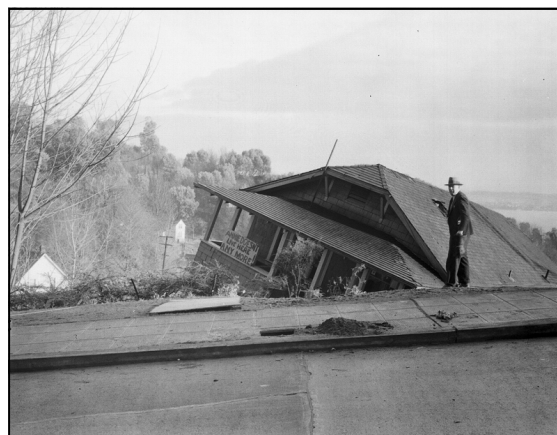
A home on Lake Dell Avenue suffering the ill effects of a landslide, December 19, 1933.