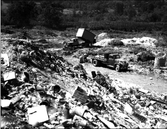
43rd Avenue Dump [now Genesee Park], August 10, 1955 Item 52768, Engineering Department Photographic Negatives, Seattle Municipal Archives

potential air quality impacts. Finally, Seattle obtained landfills in South King County, built transfer stations in Fremont and South Park, and closed the last two in-city landfills at West Seattle and Interbay in November, 1965.