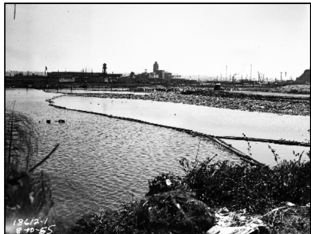
West Seattle Dump, August 10, 1955

(on the tide flats along Harbor Avenue, South Park, and N. 125 th St. at Stone Way.