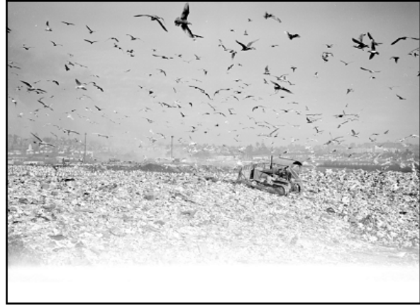
University garbage dump [seagulls flying over], February 2, 1954. Item #44895, Engineering Department Negatives, Seattle Municipal Archives.

By the 1950's, Seattle operated public landfills at University (near Husky Stadium), Interbay, 43 rd Avenue South (now Genesee Park), West Seattle