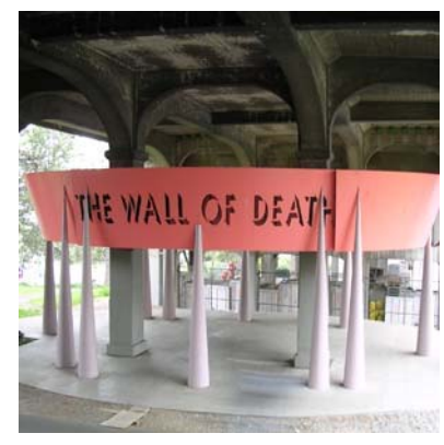
Example of stand alone sculpture - Artists: M. and C. Baden, "The Wall of Death"

past 30 years of public art in Seattle reveals a history of support for large-format permanent sculpture such as those seen underneath the convention center canopy along Pine Street. With a fresh approach, SDOT has the ability to support a greater diversity of compelling forms including small scale, two-