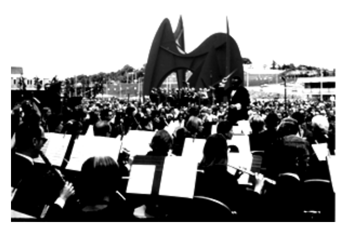
Celebration of Alexander Calder sculpture in Grand Rapids, Michigan

The programs developed here have become a model for metropolitan areas throughout the nation, Europe and beyond. Even today, the Office of Arts & Cultural Affairs continues to be at the leading edge in developing innovative programs for funding the public display of artwork.