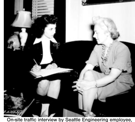
On-site traffic interview by Seattle Engineering employee circa 1946. Neg. #40581

the department from the outside. This included a general inquiry into the essential roles. responsibilities, procedures, management systems, interfaces. consultant public processes, outside influences, decision making mechanisms, staff attitudes/opinions, project successes/failures, inter-departmental communication. intra-division collaboration, and funding systems. In full disclosure, the Mayor's Office and the Office of Planning and Management were out of the jurisdiction of the artist-in-residence and are therefore two important