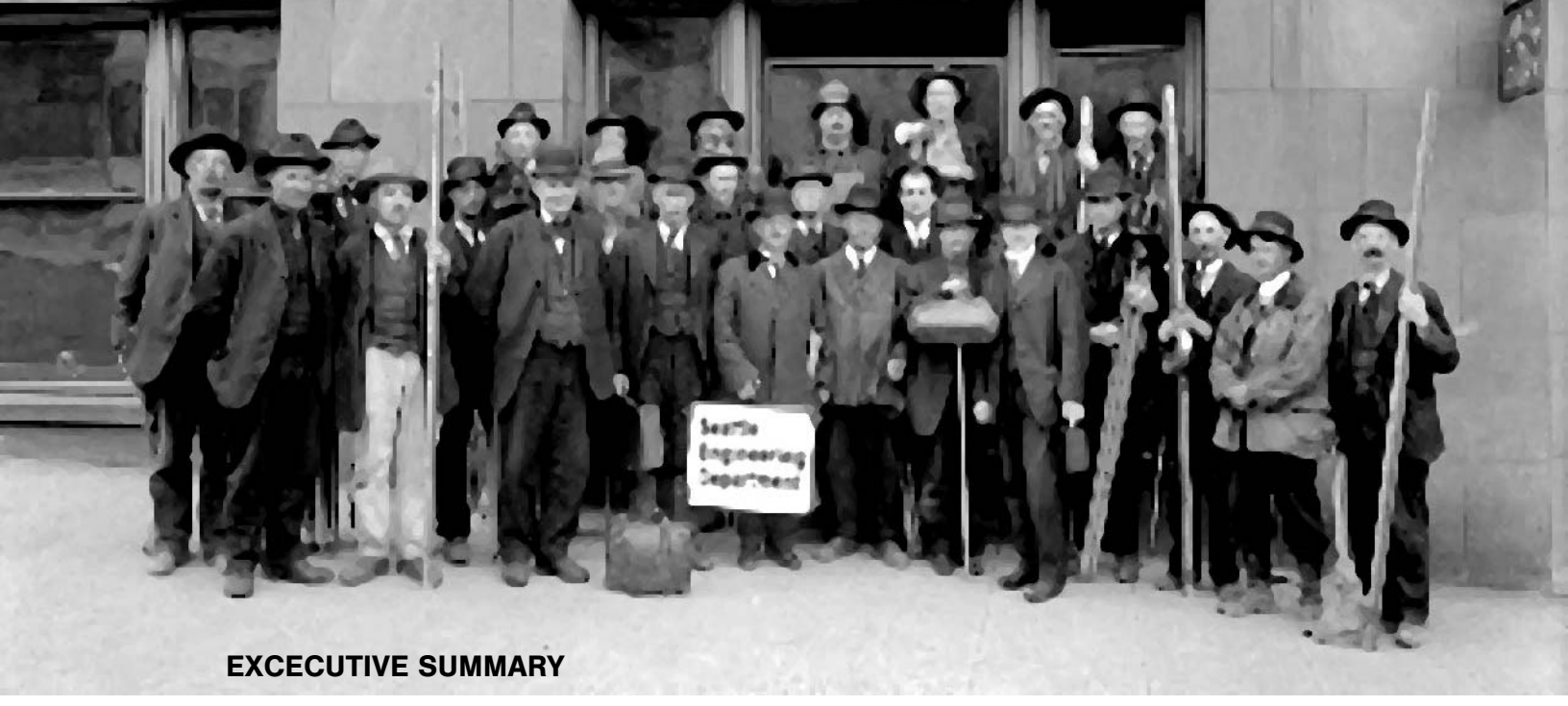
"...the singular most important element for inventing the characteristics that make a city successful and unique is the artistic". - Michael Sorkin, author and urban theorist

Two years in formulation, the SDOT Art Plan is written to be both critical and visionary. It is focused as a plan of action, comprehensively detailing how Seattle can become a national leader in creating a more humane, layered, beautiful and relevant transportation system. It offers a completely new methodology for rethinking the practicality and use of our shared right-of-way. By employing the work of artists, the creativity of citizens and the ingenuity of SDOT employees, the gradual implementation of this plan will contribute significantly to a Seattle whose streets and sidewalks celebrate life, discovery and creativity.