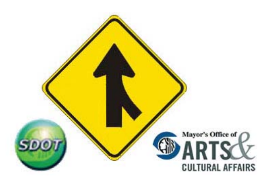
This Art Plan has been tailored for the Seattle Department of Transportation by its Artist-in-Residence in collaboration with the Mayor's Office of Arts & Cultural Affairs

My residency with the Seattle Department of Transportation (SDOT) proved to be endlessly fascinating and rich with opportunities for theorizing about art, aesthetics, culture and the future of Seattle. I had the sincere pleasure of working closely with the Capital Projects and Roadway Structures management team for the better part of a year (part-time) and enjoyed every minute of it.