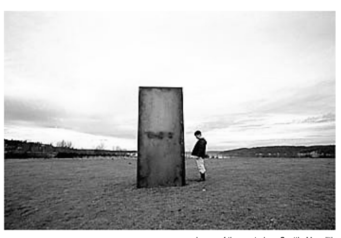
Image of the mysterious Seattle Monolith

public safety risk. Eventually the work was trucked away without event but not before the local papers published dozens of opinions about the sculptures' origin and artist's intent. These and other unofficial guerilla art works suggest that there is fertile territory to be explored. If no other outlet is allowed, perhaps there is a way to loosen up the Street Use Permit process to allow for the temporary placement of citizen-generated artwork in the right of way. This would allow for a safety check at the minimum and potentially save SDOT from over reacting to an otherwise harmless creative gesture.