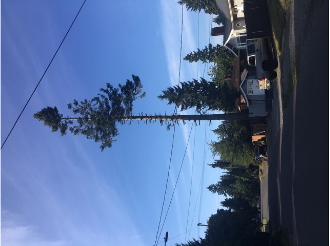
105th NE and 17th NE