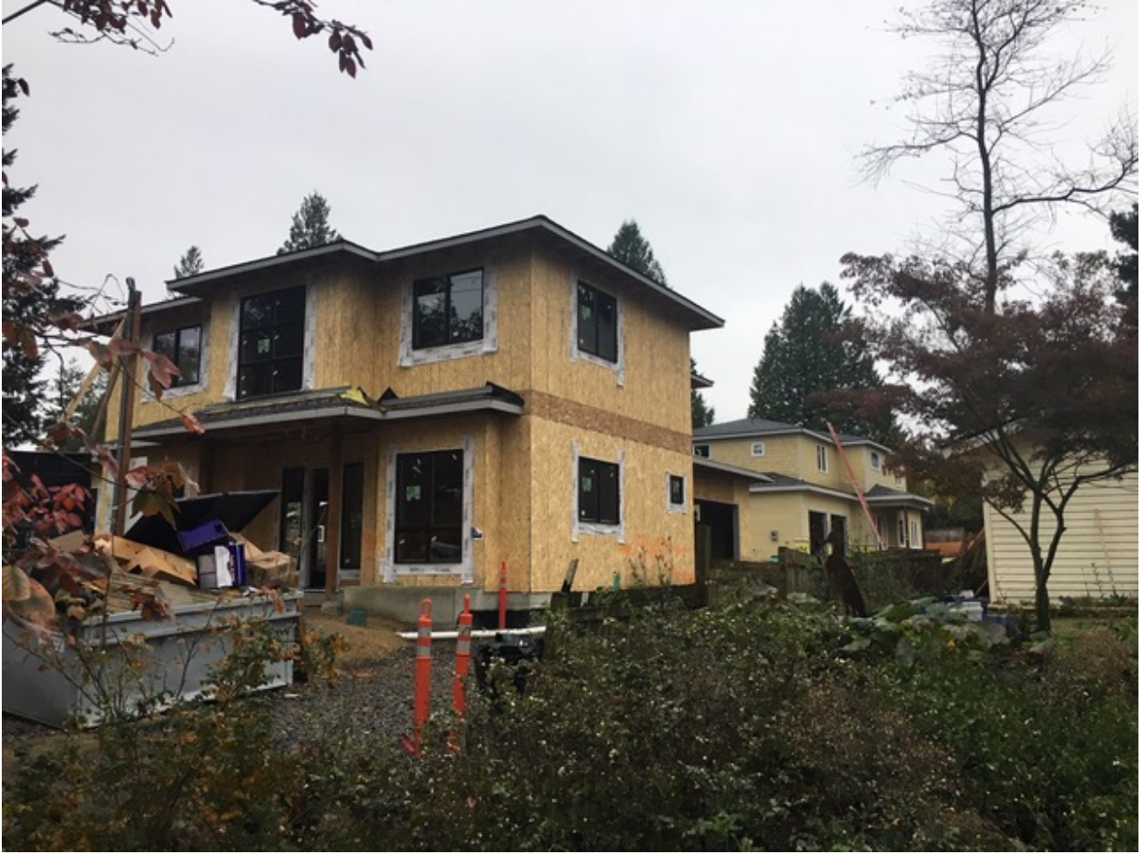
11347 20 th Ave NE