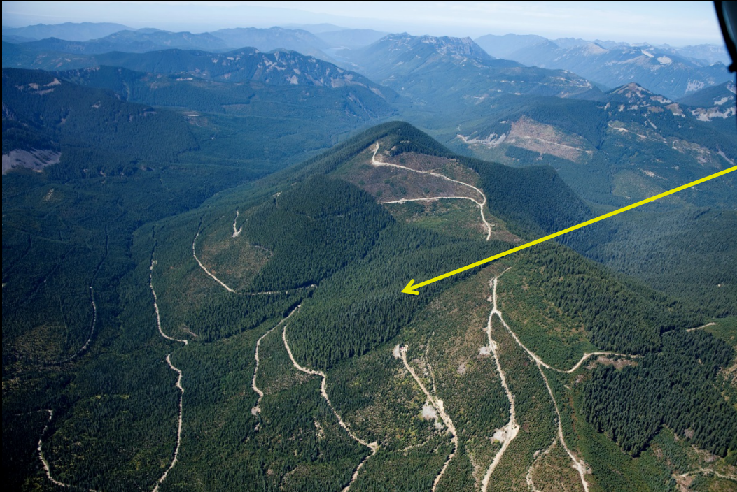
Looking west into the watershed

Far east end of the upper watershed at the end of the 557 road (one hour from Cedar Falls)