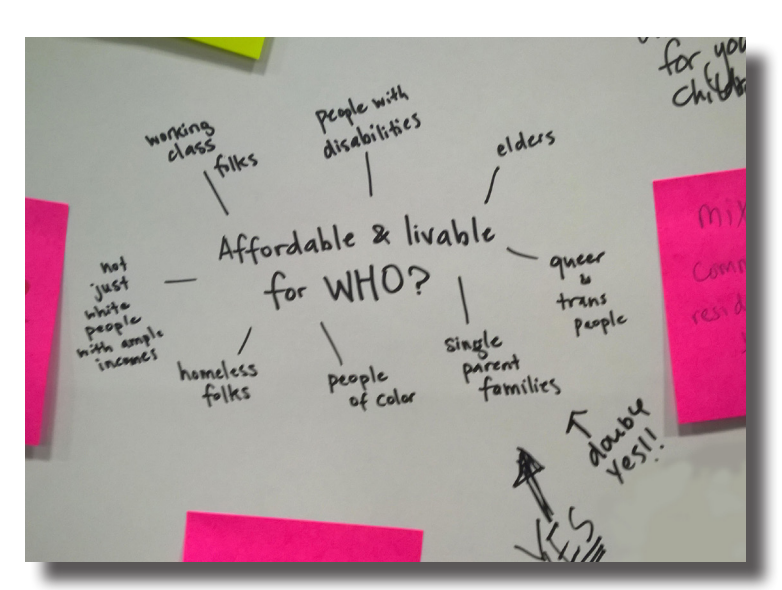
Community member comments from a HALA Open House meeting in November 2015.

Your ideas will shape how HALA recommendations are implemented, especially in neighborhood areas.