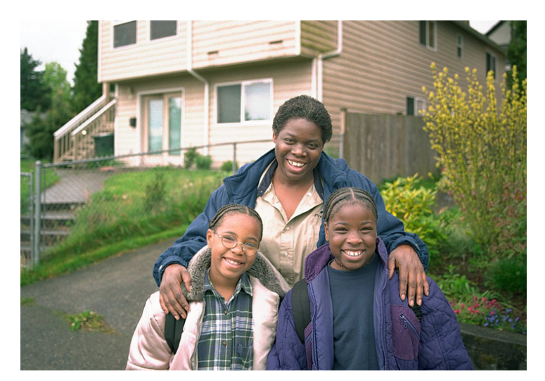
Legislation would protect tenants from rent increases without adequate notice.

+ Streamline the penalty structure for violations of the Housing Code.