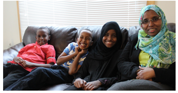
In 2015, the Office of Housing awarded a record $57 million that will enable over 900 new affordable units for low-income households.