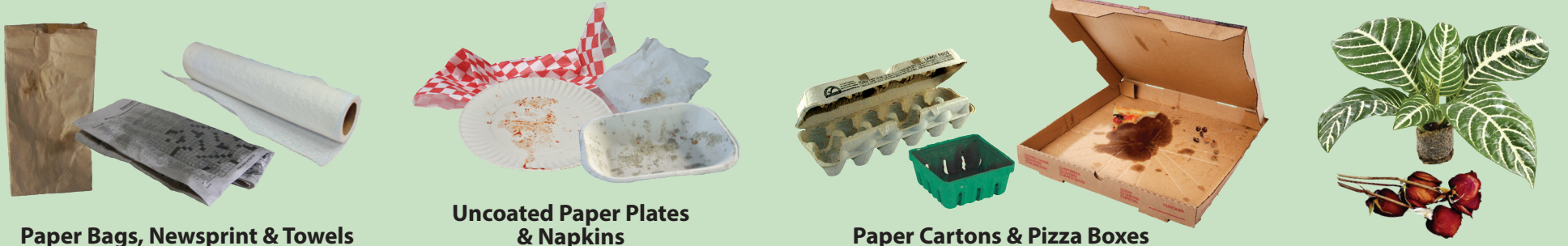
Paper Bags, Newsprint & Towels