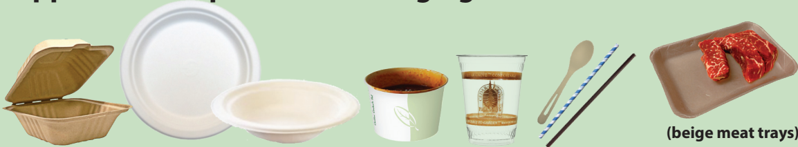
(beige meat trays)