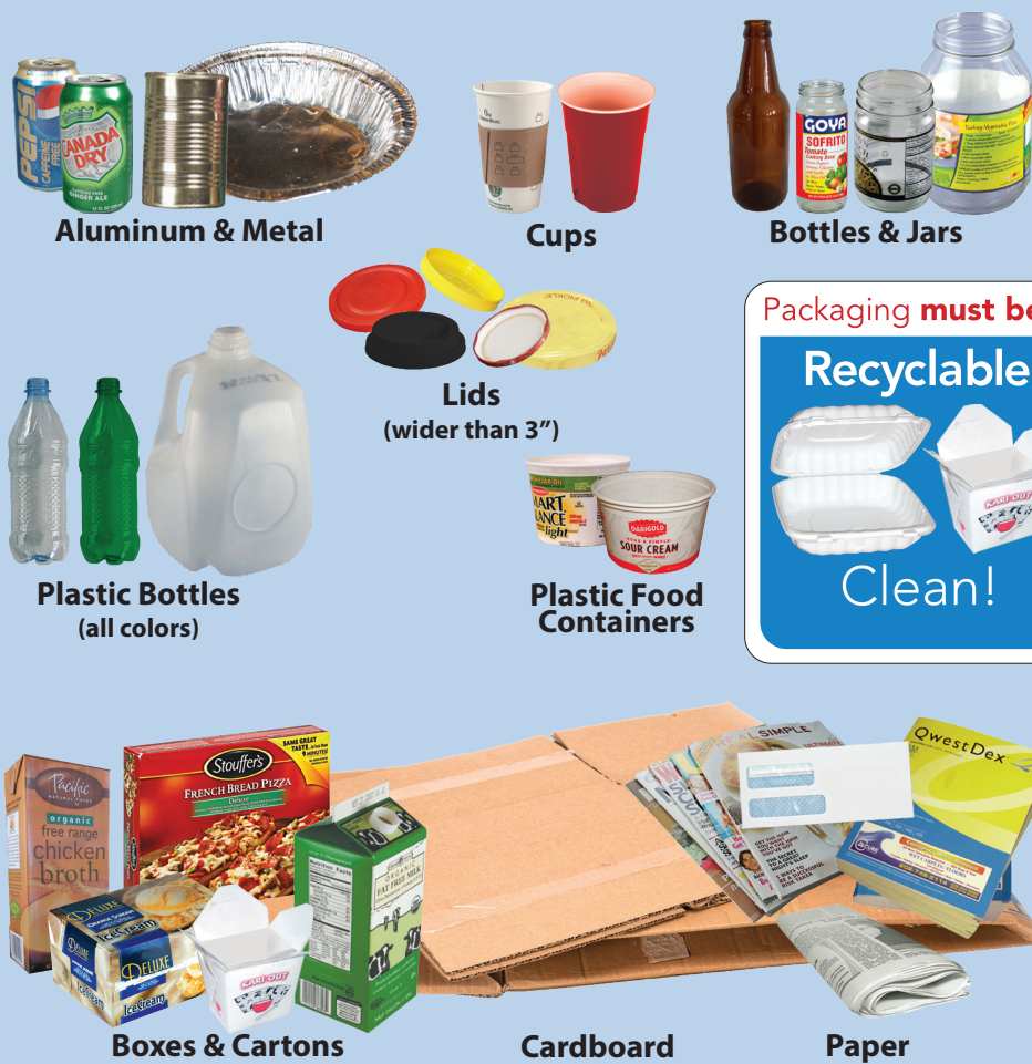
Aluminum & Metal

Put these CLEAN items in your recycling container