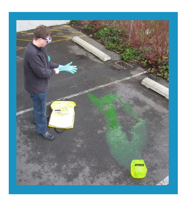
Evaluate the situation. Put on protective equipment. Implement your site specific spill plan.