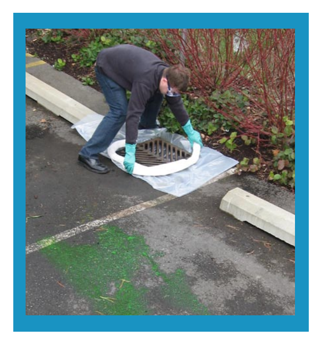
Protect the storm drain. If material has entered a storm drain, notify agencies listed on the back of this poster.