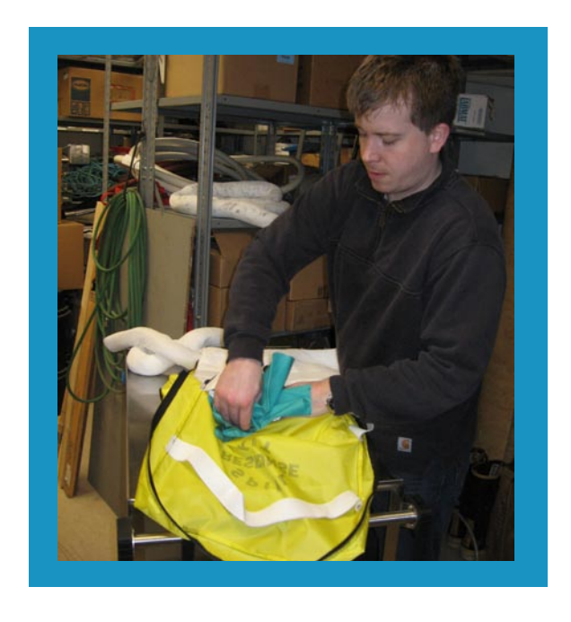
Replenish the spill kit. See reverse side for vendor information.