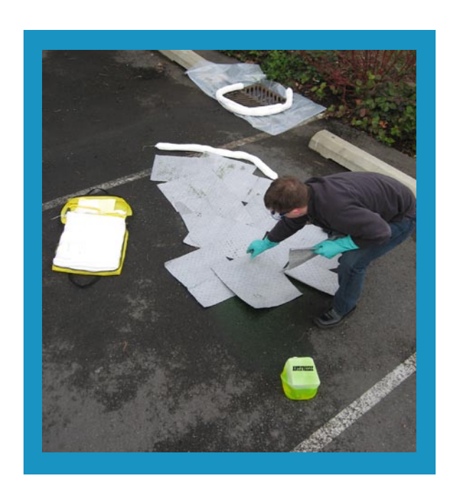
Apply kit materials to spill.