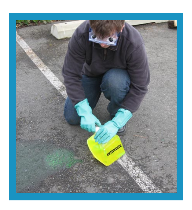
Stop the source of the spill.