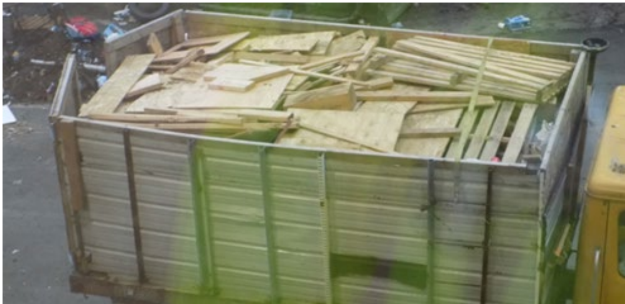
A load of clean wood disposed at one of Seattle’s transfer stations

Though some C&D debris enters Seattle’s waste stream via the transfer stations, most non-recyclable C&D debris in Seattle is disposed of through private transfer stations, which typically have lower tip fees than Seattle’s public transfer stations. Private transfer stations are typically set up to handle large, self-unloading trucks. Two railheads in Seattle accept large intermodal containers directly—mostly from demolition projects—for transport to a landfill. Table 8.4 lists facilities designated by the City to receive C&D debris from jobsites in Seattle for disposal of nonrecyclable mixed C&D debris.