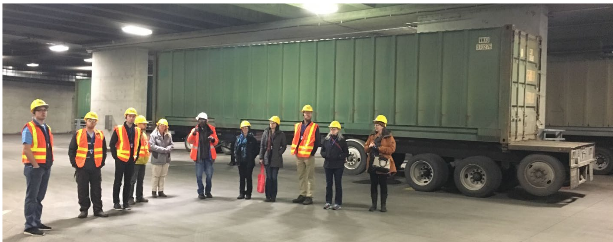
SPU staff by an intermodal container during a transfer station tour

Seattle Municipal Code limits the hauling of C&D debris destined for disposal using dumpsters and drop-boxes to designated contractors selected by SPU. Seattle has contracted for disposed C&D debris collection since 2001 and awarded the current contract to Waste Management, Inc. in 2019. Material hauled by Seattle’s contracted collector represents only a small portion (less than 1%) of the C&D debris generated within the city, because most of Seattle’s C&D debris is either self-hauled by the construction contractors that generate the material, hauled by third-party private haulers for recycling, or collected directly in intermodal freight containers for transport by rail to landfill for disposal. The following explains who may haul C&D debris in Seattle based on the type of destination facility, either disposal or diversion.