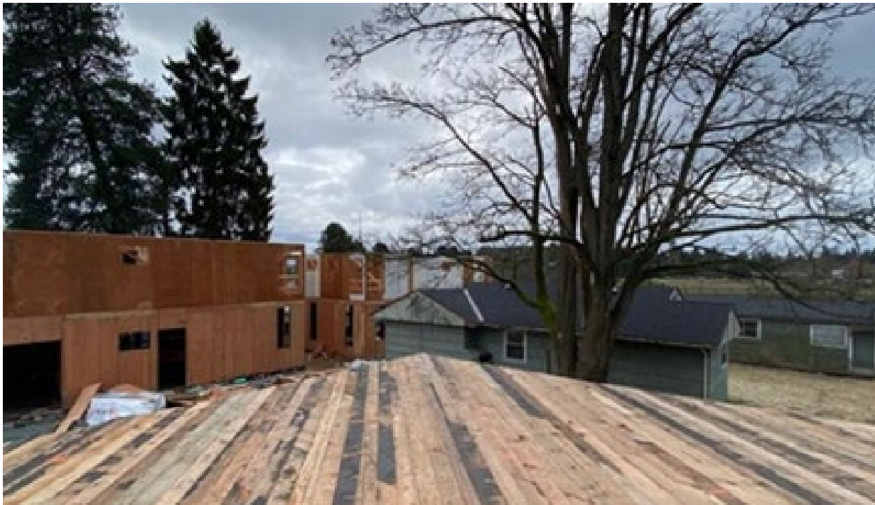
Construction site for three new homes using reclaimed lumber in West Seattle

Source-separated C&D debris recycling facilities. These facilities recycle single commodities that have been separated at the job site, such as clean wood waste, concrete, gypsum scrap, metal, or tear-off asphalt shingles. Source-separated facilities account for much of the C&D debris recycling in the region. These facilities are often located outside Seattle, usually have very low tip fees compared to disposal, and report achieving high recovery rates (around 95%).