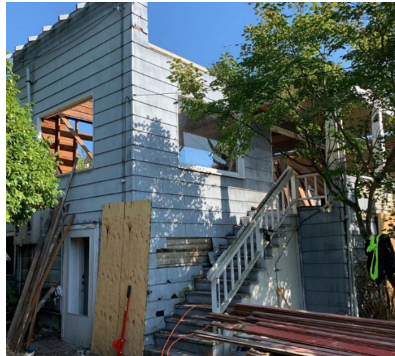
Sledge Seattle deconstructed a house by hand and salvaged lumber for reuse in new construction as part of an SPU grant project.

Given that Seattle does not currently incentivize deconstruction and demolition is typically the less expensive option, SPU is working with King County to evaluate the feasibility of a residential deconstruction ordinance and contractor certification program. SPU and King County formed the Deconstruction Advisory Group to develop an ordinance that would require deconstruction or alternative methods to substantially increase deconstruction, such as the deconstruction policy implemented by the City of Portland, Oregon. Portland requires deconstruction instead of demolition of single-family homes or duplexes built in 1916 or earlier or designated a historic resource. 8 Portland’s ordinance covers approximately one-third of single-family demolition permits.