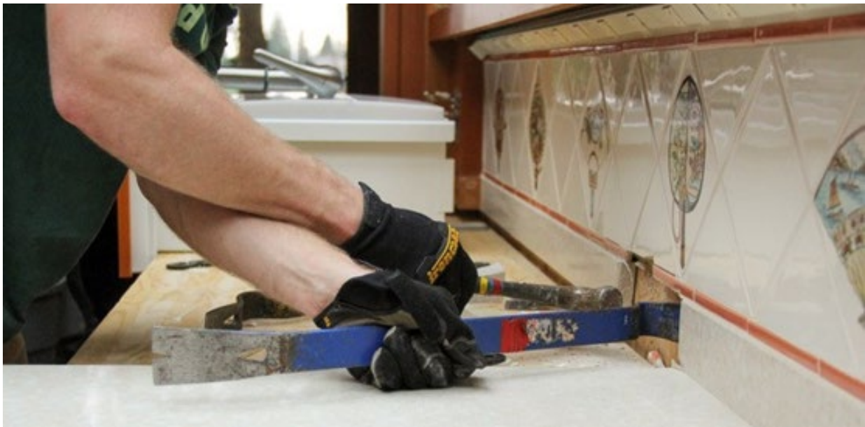
Kitchen tile removal for salvaging

For alteration projects, the salvage assessment can be completed by an owner or owner's representative. For whole building removal, the assessment must be completed by a salvage verifier, which is a salvage or reuse retail company or a professional deconstruction or demolition contractor with knowledge of salvage retail markets.