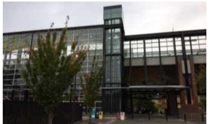
Mt Baker Light Goobta Tareenka

qaab sifiican ugu habboon aragtida bulshada. Hawsha tan waxaa hogaaminaya Xafiiska Qorshaynta iyo Horumarka Bulshada