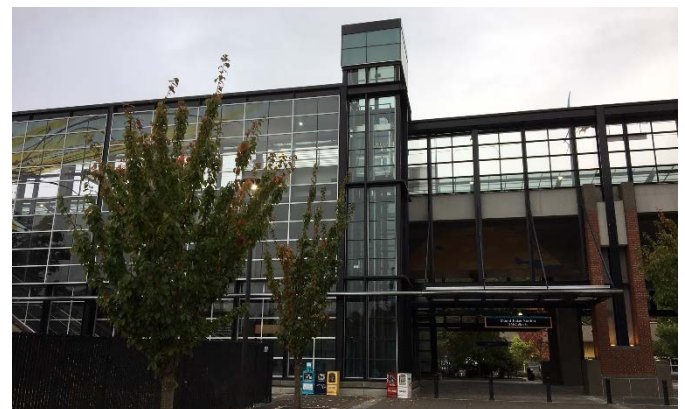
Mt Baker Light Rail station

2. We're collaborating on a multi-agency team focused on Mt Baker Station Area Planning to identify feasible and tangible actions that coordinate investments in a way that best meets the community's vision. This process is being led by the Office of Planning and Community Development.