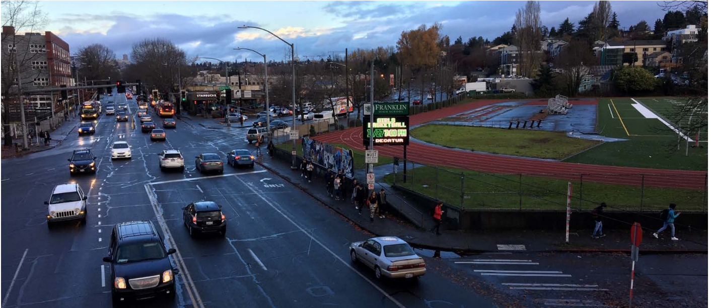
The Rainier Ave S and Martin Luther King Jr Way S intersection is in the middle of major destinations including the Mt Baker Link Light Rail Station, King County Metro Transit Center, Franklin High School, housing, and retail.