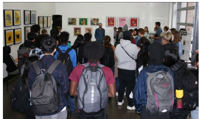
Mt Baker Hub outreach event with Franklin High School students

We want to hear from people who live, work, shop, and travel through the area. Rank your project choices in the online survey by December 11! www.surveymonkey.com/r/AMB_Survey