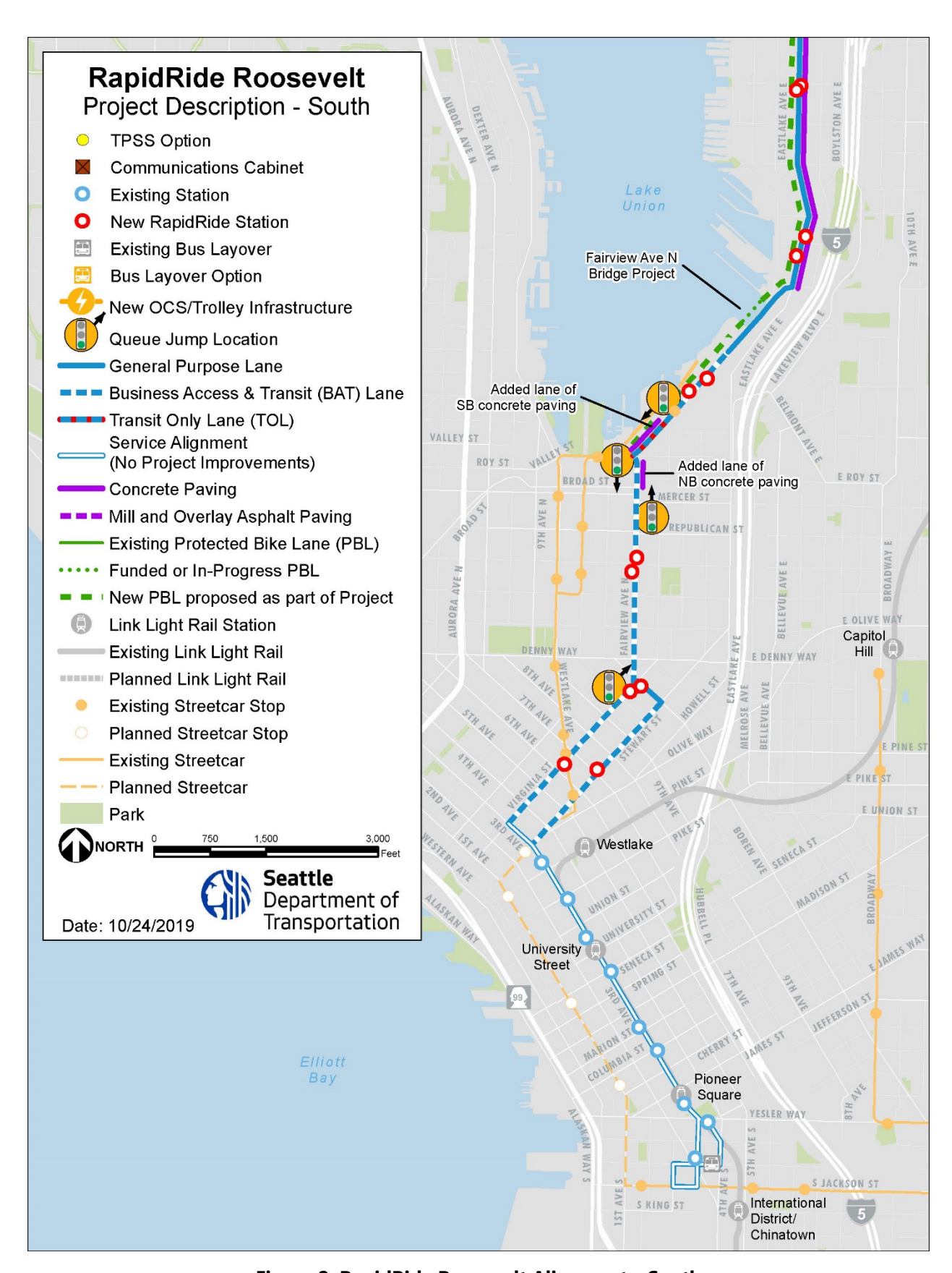
Figure 2. RapidRide Roosevelt Alignment - South