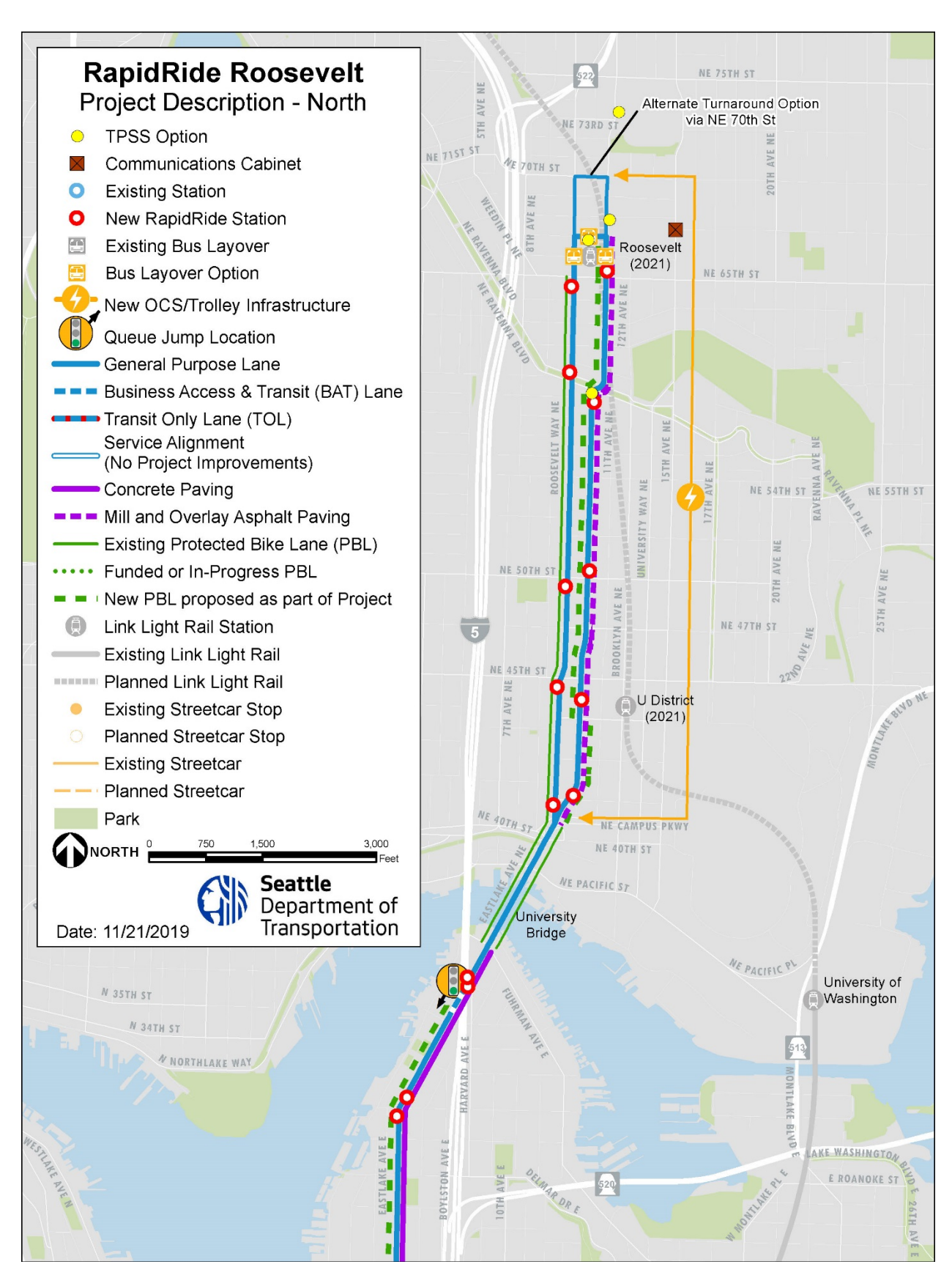
Figure 1. RapidRide Roosevelt Alignment - North