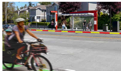
Conceptual design of SW Henderson St shelter.

Public transit is an important part of how we will meet the diverse needs and priorities of our rapidly growing region. The City of Seattle and King County Metro are working to expand Metro's RapidRide transit network to meet growing demand for transit and support access to public transportation that is reliable, fast and on-time.