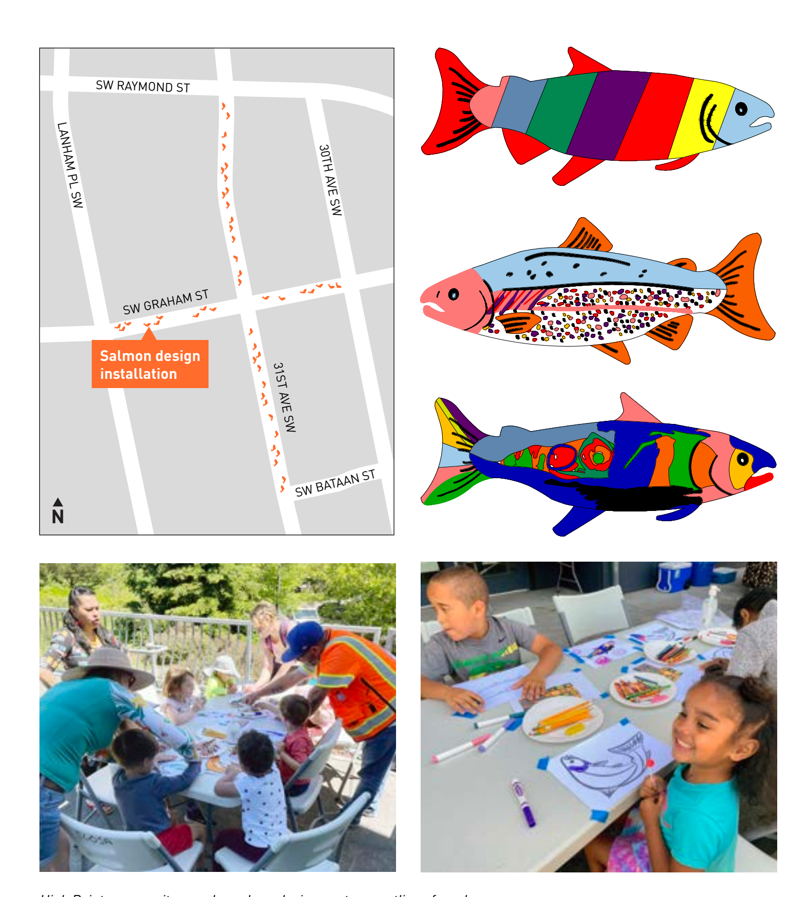
High Point community members draw designs onto an outline of a salmon.