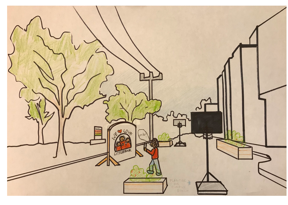
Art by Little Brook Youth Corps lead trainer, Nicole Dillman

We'll close the block outside of Little Brook Park to vehicles and open it up to play!