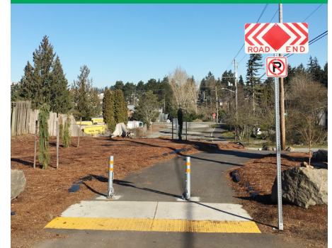
2018 cost effective walkway project that reconnected Ashworth Ave N south of N 125th St for people walking and biking.

To learn more about this project, see our website at www.seattle.gov/transportation/projects-and-programs/programs/greenways-program/ashworth