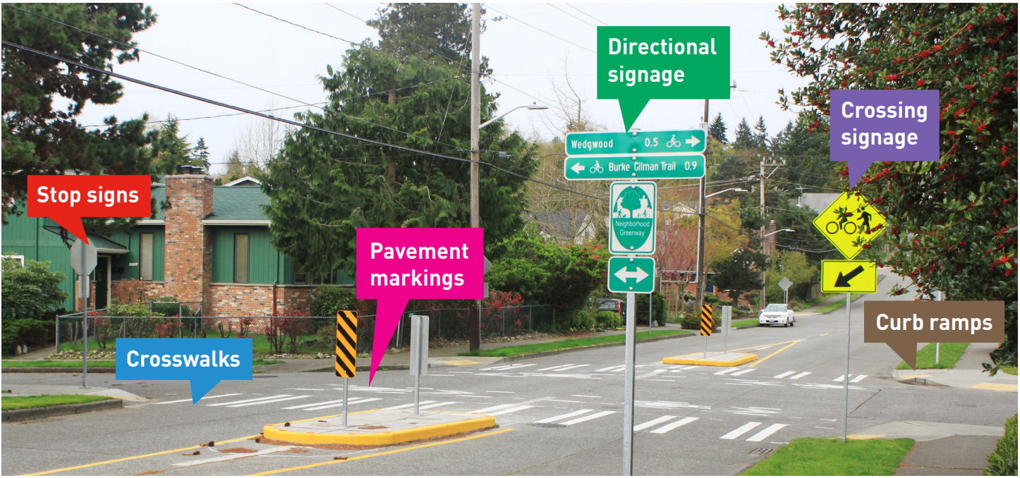
Example: neighborhood greenway improvements to help people cross busy streets.

Para servicios de traducción, por favor llame al (206) 684-8766.