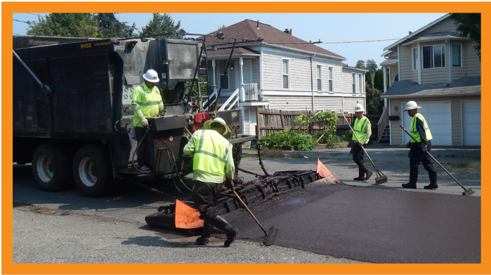
Example: microsurfacing pavement repair work.

WHAT IS A NEIGHBORHOOD GREENWAY? Neighborhood greenways are safer, calmer residential streets for you, your family, and neighbors that make people walking and biking the priority. We will add signs and pavement markings to help people find their way and make it easier to cross busy streets with curb ramps, crosswalks, and flashing lights (see map for locations of crossing improvements). We'll also make pathway improvements where the route connects between streets and build a new connection to the Mountains to Sound Trail.