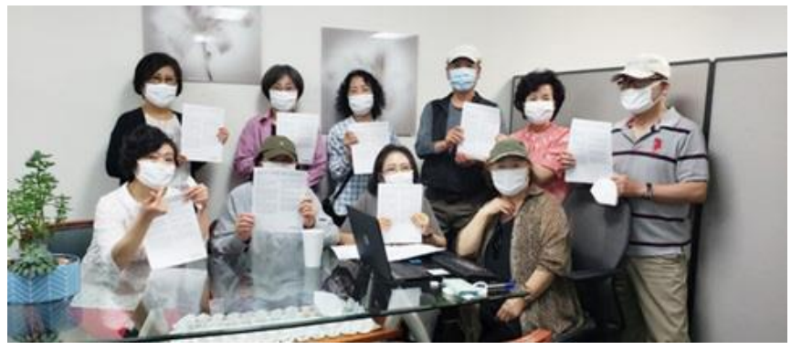
*Prioritization by the Seattle Freight Advisory