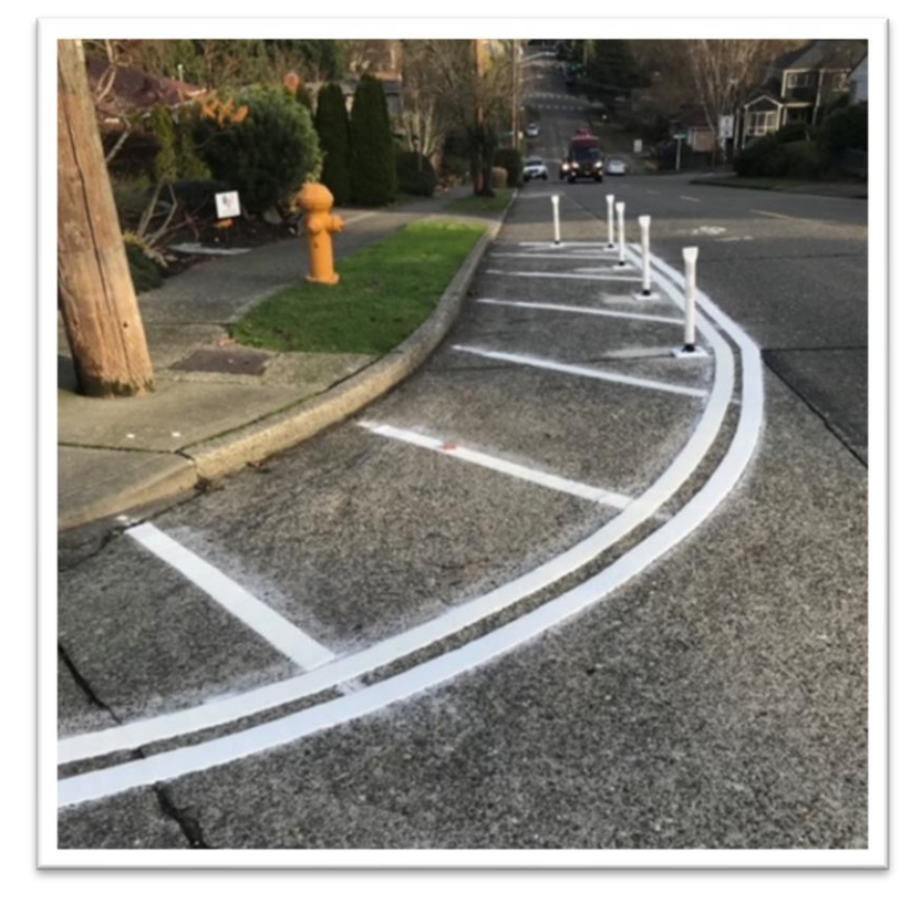
Crews installed 6 paint and post projects at three locations in the Fauntleroy neighborhood, and two at Marginal Way Pl and 17<sup>th</sup> Ave SW.