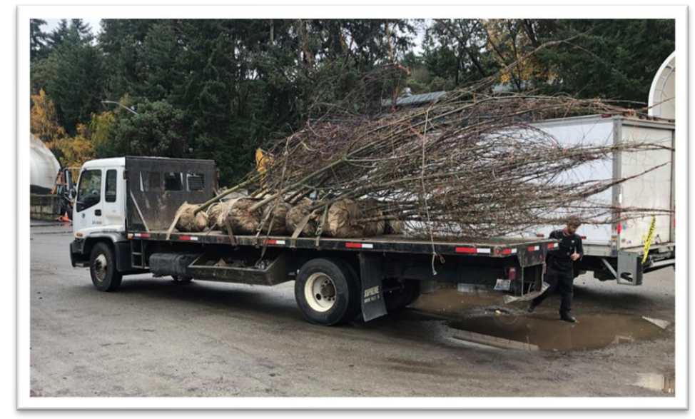
SDOT Urban Forestry crews are currently planting 100 trees in the Highland Park Home Zone. 50 trees are going on SW Barton St, which will be a Neighborhood Greenway in early 2022