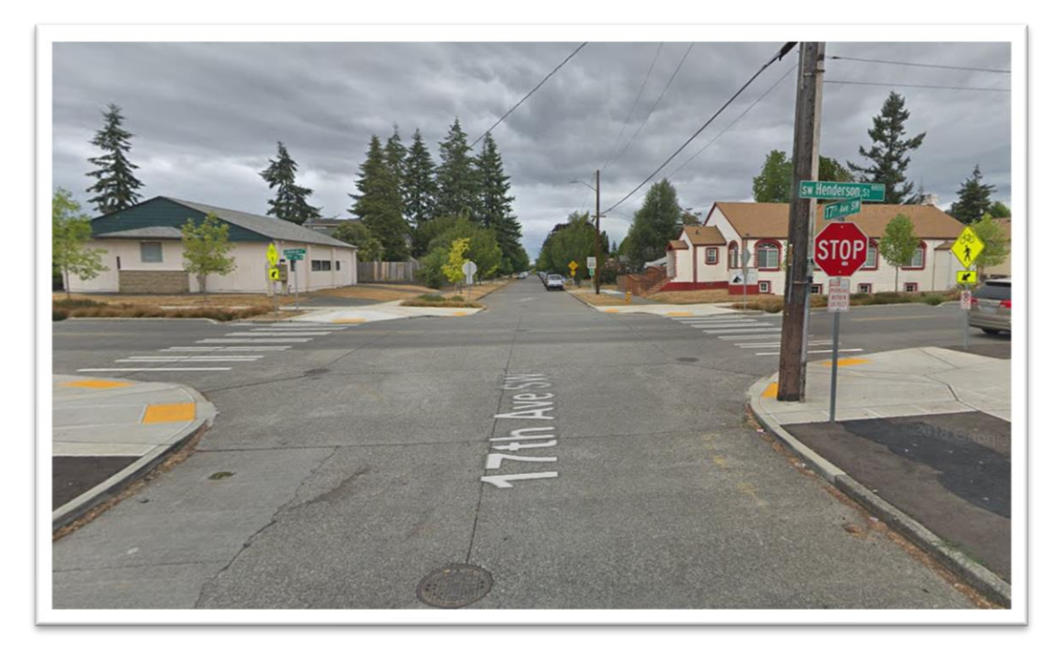
Existing conditions at intersection of SW Henderson St and 17th Ave SW