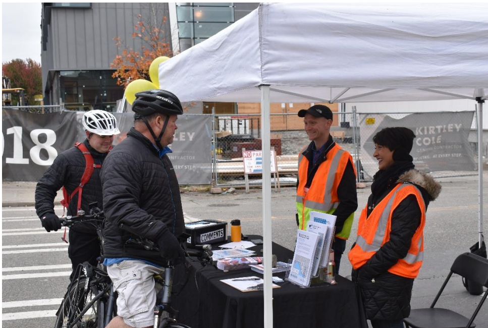
Project staff talk to attendees at the self-guided walking tour of the Missing Link