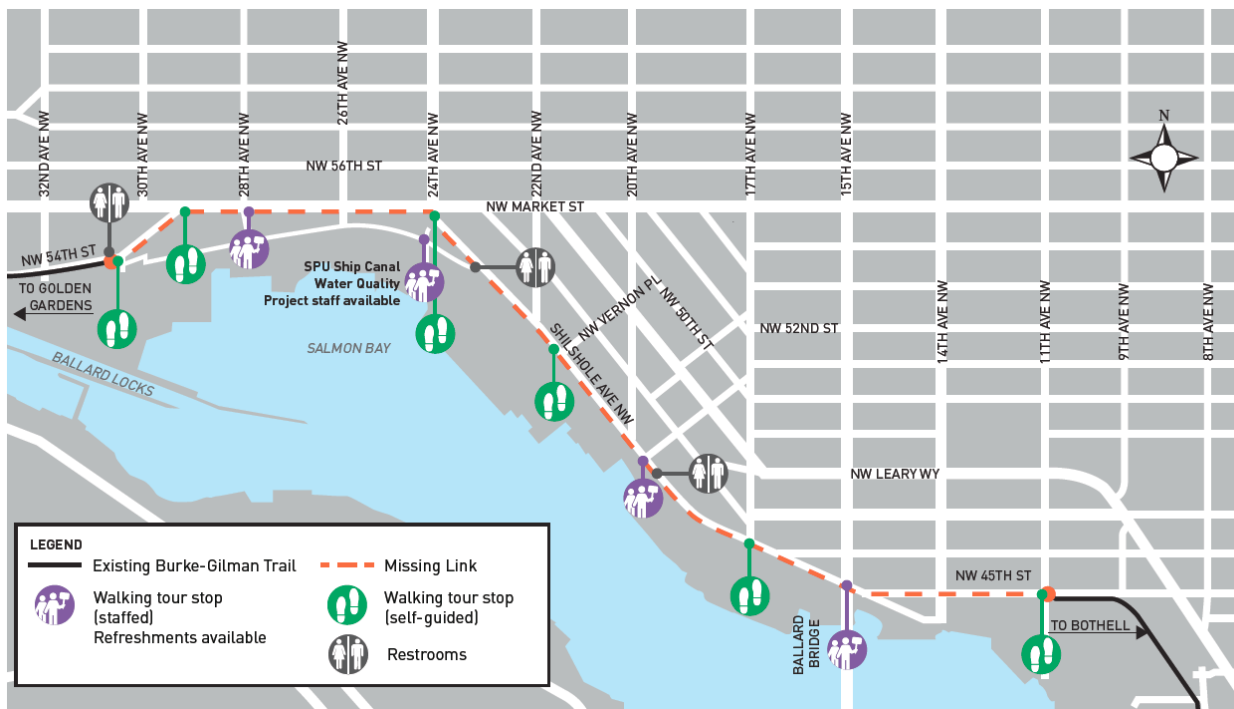
Map of self-guided walking tour of the Missing Link

To engage stakeholders and community members from the Ballard area, SDOT held a self-guided walking tour along the Missing Link corridor where attendees could walk the corridor, see the updated design, and talk to project staff.