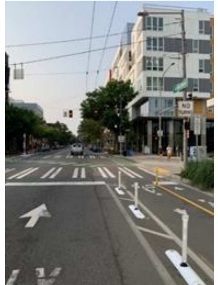
New bike signal and crossing improvement on Broadway and E Denny Way.