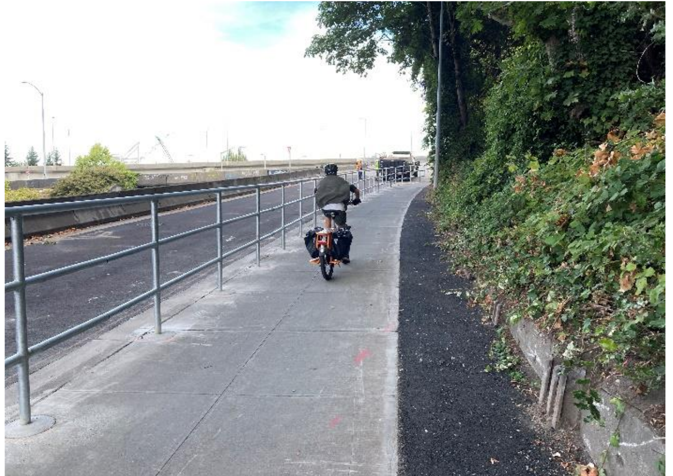
Delridge Neighborhood Greenway Safe Connections (West Seattle Bridge Trail) project.