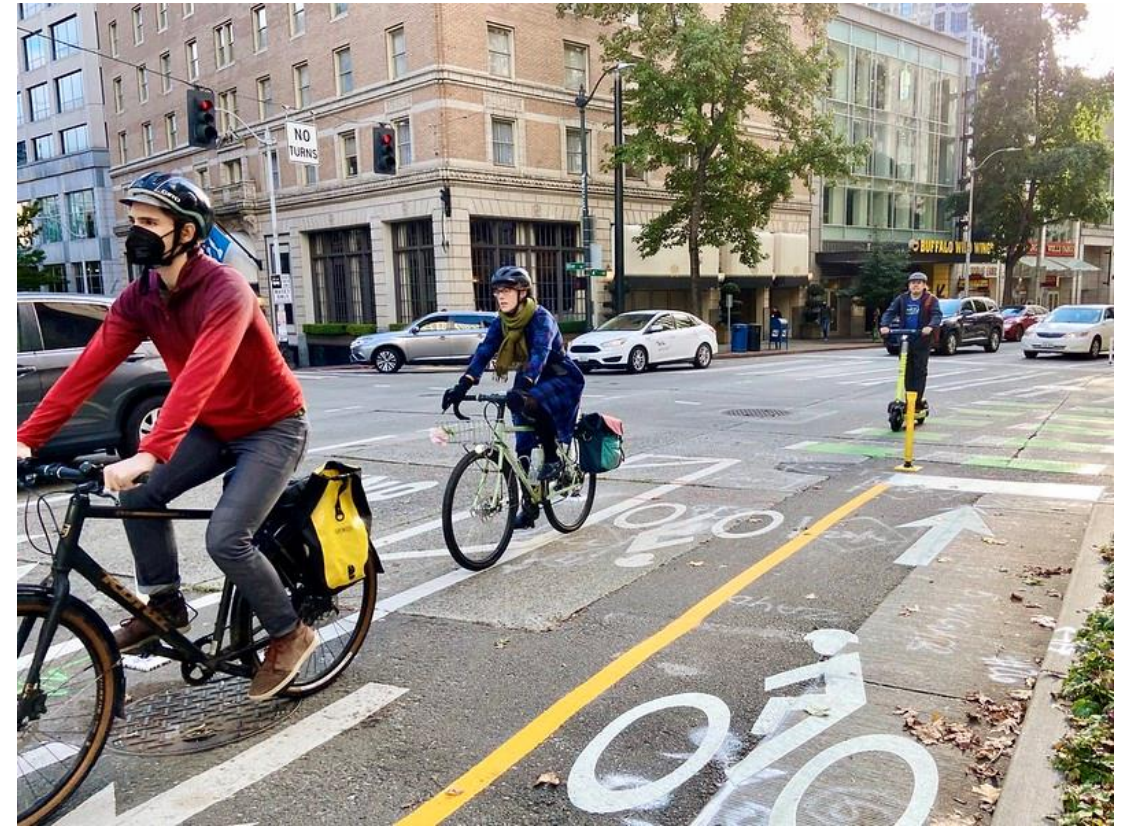
Riding the new 4th Ave protected bike lane.