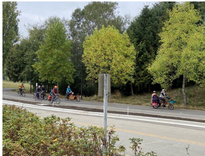
Opening of the John Lewis Memorial Bridge.