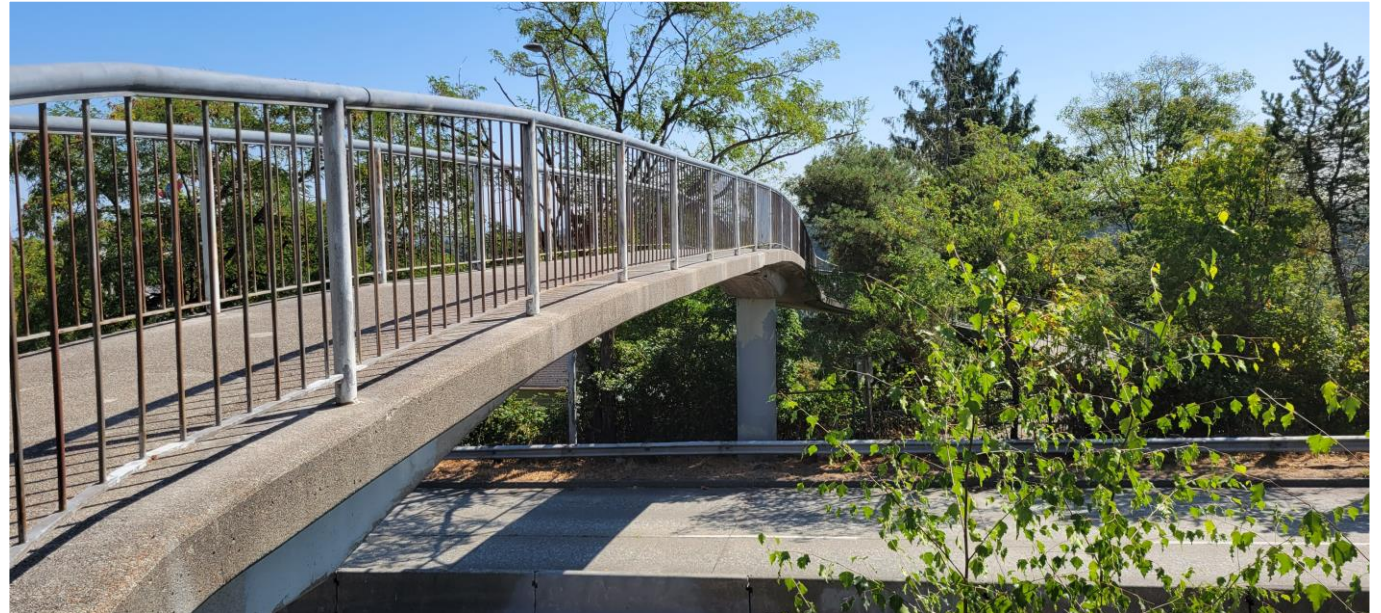
SW Andover Pedestrian Bridge.