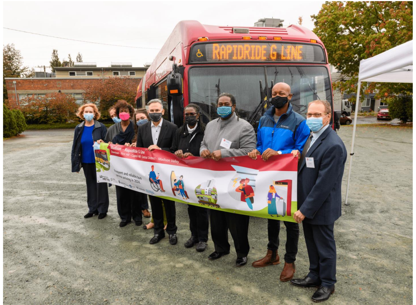
Public transportation leaders, elected officials, and community representatives together to celebrate the start of Madison - RapidRide G Line construction.