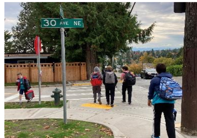
Clockwise from top left: Hardened centerlines on Rainier Ave S in use; hardened centerlines under construction; new raised crosswalk at Eckstein Middle School; sidewalks and curb ramps at Magnuson Park as part of the Sand Point Way Vision Zero project.