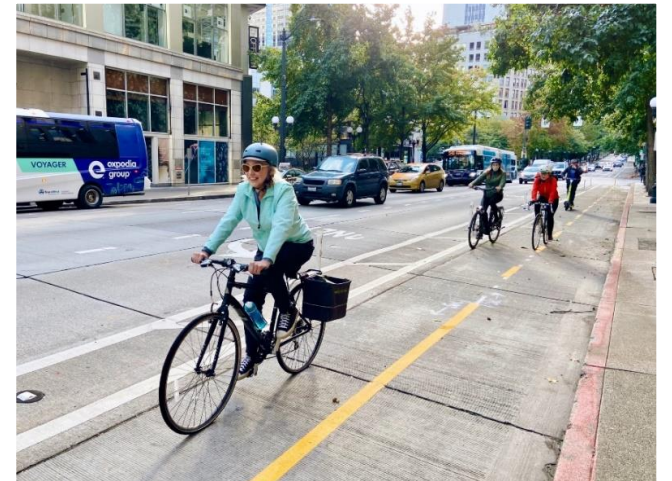
Clockwise from left: W Green Lake Way protected bike lane in construction, NE 43rd St protected bike lane and street redesign, 4th Ave protected bike lane.