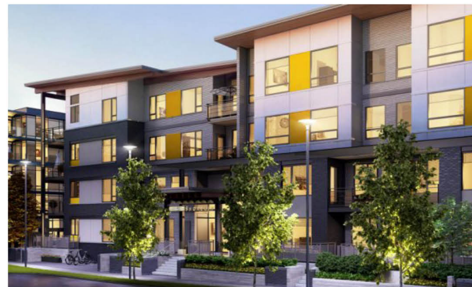
3 - 4 Story Multi-Family Building.