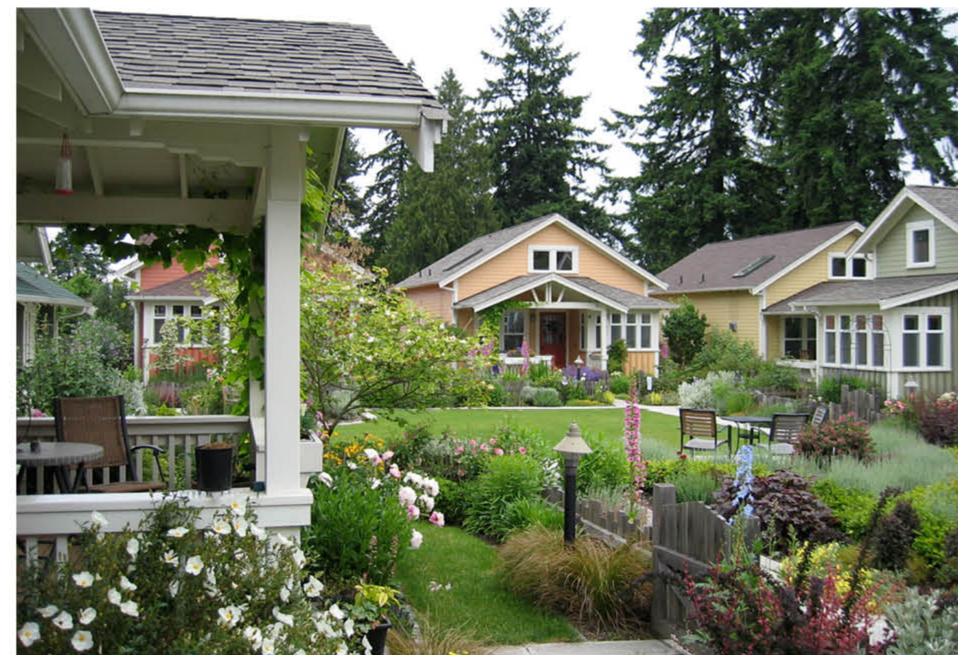
Cottage Housing. Cluster of small cottage homes.