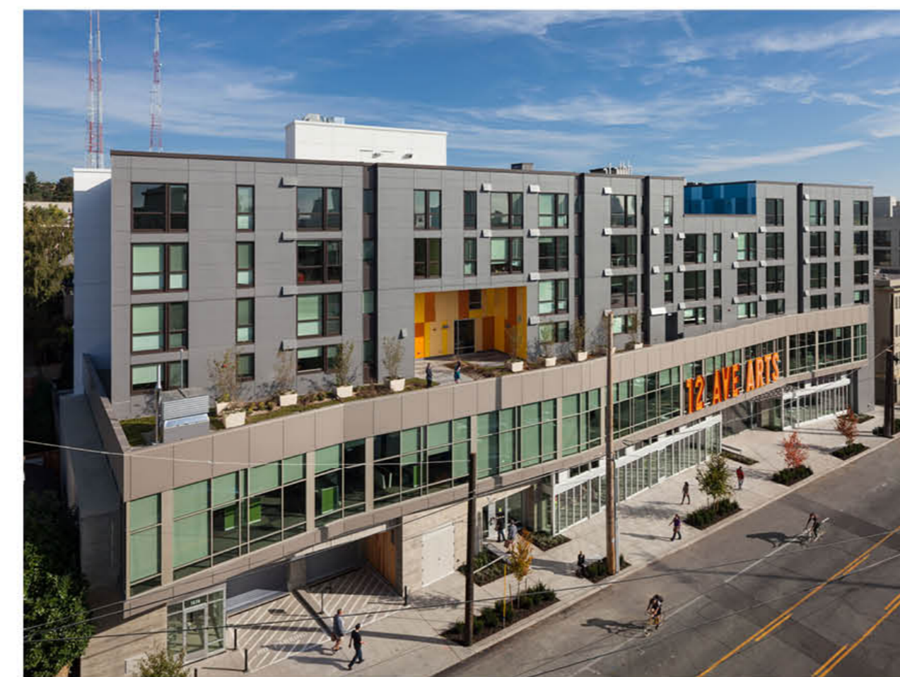
5 -6 Story Multi-Family Building, or Mixed-Use Building.