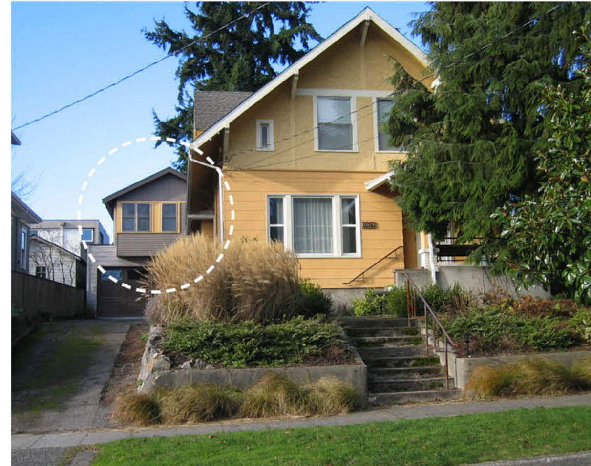
Single Family Home With a Backyard Cottage. (Detached Accessory Dwelling Unit or "DADU")