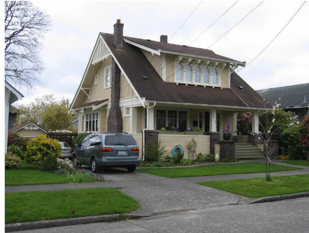
Single Family Home On a 5,000 SF Lot.