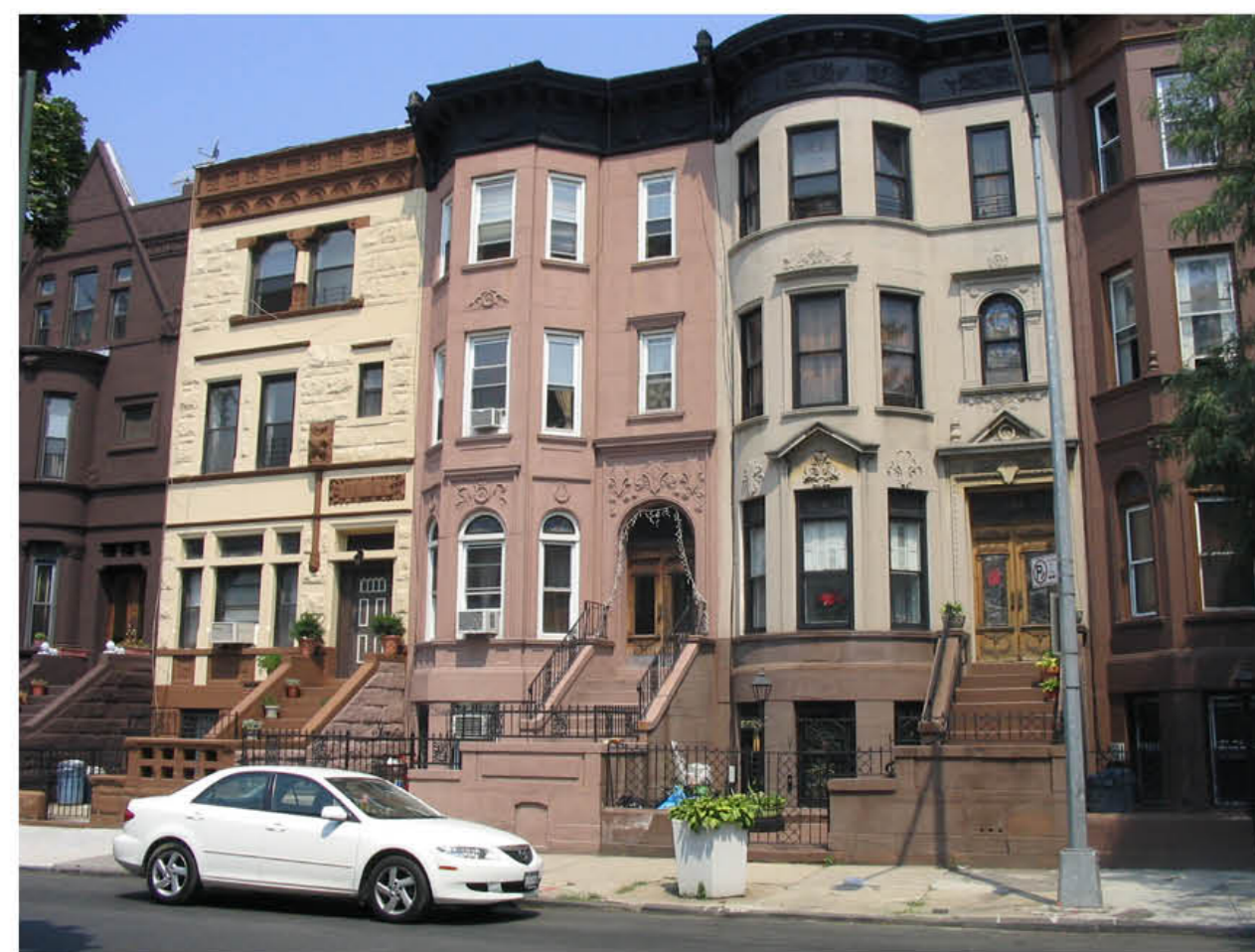
Attached Rowhouses. This example is from an East Coast city.