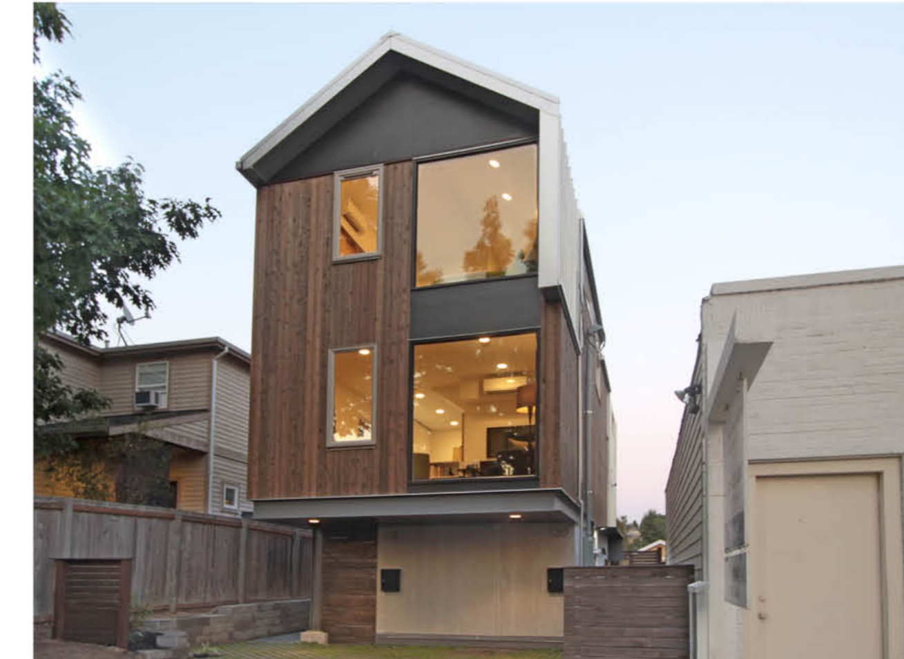
Duplex or Triplex Homes. Different units could be stacked or placed side-by-side.