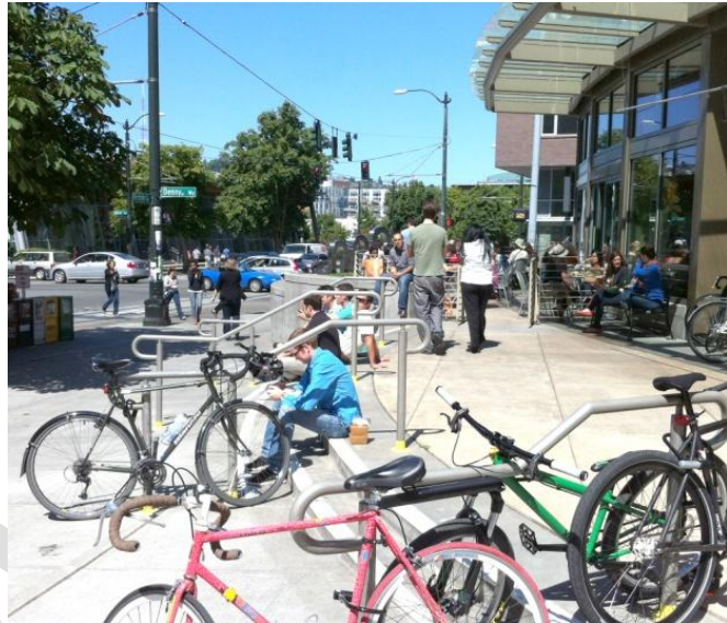
Where grade changes along the street, the storefront is setback to allow café seating on a plinth that is raised slightly above the sidewalk level.