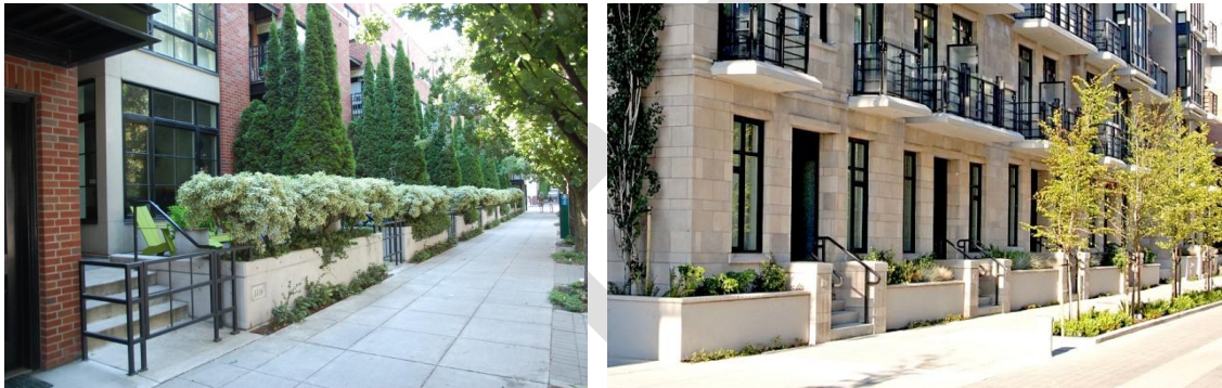
Street facing front entries with small terraces, entry stairs, a slightly raised first floor, and landscaping.

Provide townhome-style units with individual unit entries facing the 10 th Ave E. side of site B. Provide stoops, front entries and terraces that encourage residents to use the 10 th Ave E. frontage. Use stairs to units and landscaping to screen the potential ½ level of above grade parking that will likely be necessary at this location.