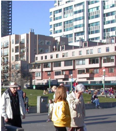
The mass and height of the buildings preserves sun exposure onto the plaza space.

Scale mass of buildings on sites A and C facing the Plaza and the E. Denny Way Festival Street so as to provide favorable sun and air exposure to the proposed plaza and Festival Street.