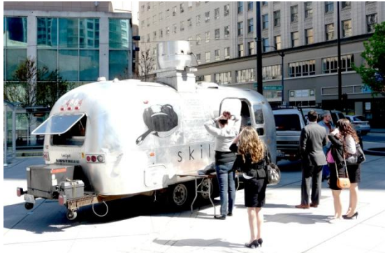
Utility hookups in the plaza allow for street food at certain times.

Within the plaza, consider appropriate substructures, built elements and utility connections to ensure the proposed plaza can be used for Farmer's Markets, performance and other temporary uses that provide interest and activity. Take advantage of grade changes between the plaza level and adjacent sites to create transitions that can be used for seating or other amenities.