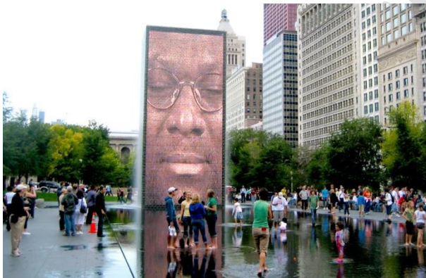
A public art display on a vertical element in the plaza provides a focal point and helps to activate.

Explore architectural features within ground level facades at the proposed plaza such as recesses, bays, colonnades to ensure interest and variety.