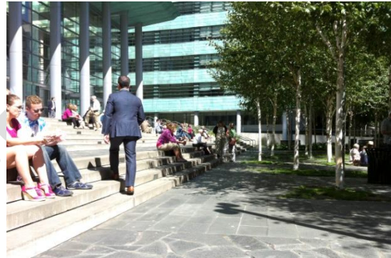
The grade change where a building faces a plaza helps with activation and provides places to sit.