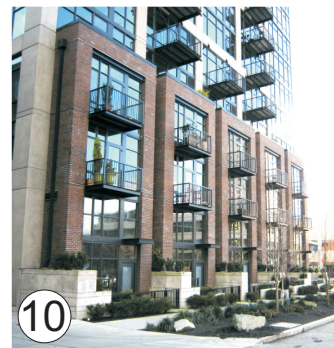
10 Multifamily with walk-up units on ground floor