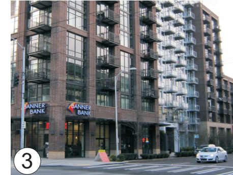
3 Ground-floor retail at corner with residential above and at street-level