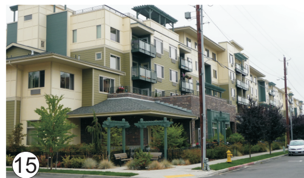
15 Small setback with landscaping and gathering space