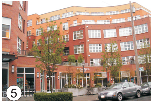
5 Ground-floor retail with set-back residential above