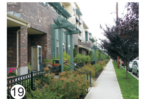
19 Ground-floor walk-up with landscaped setback