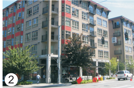
2 Ground-floor retail with residential above