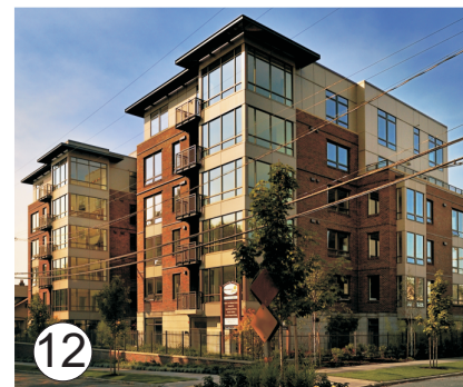
12 Small front setback with fence and landscaping