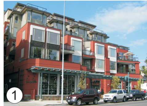
1 Ground-floor retail with set-back residential above