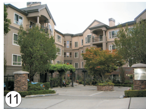
11 Multifamily with courtyard entrance