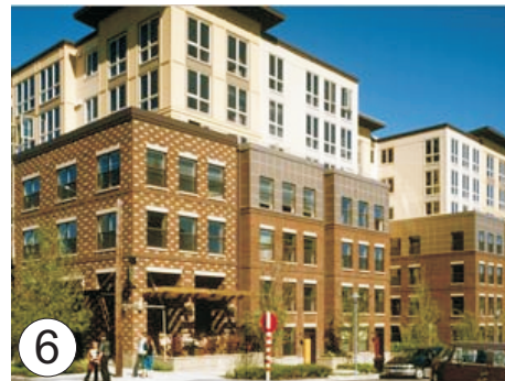
6 Ground-floor retail at corner with residential above and at street-level