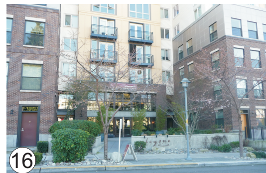
16 Setback courtyard entrance