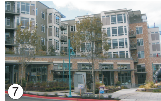
7 Ground-floor retail with residential set-back above