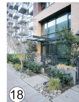
18 Ground-floor walk-up