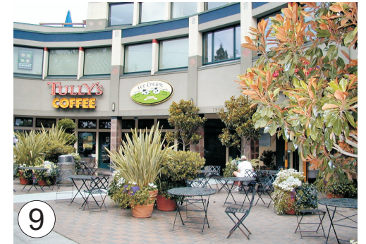
9 Courtyard with retail with residential/office above