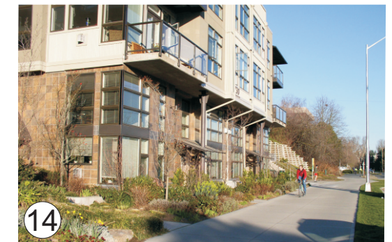
14 Front setback with landscaping and walk-up units