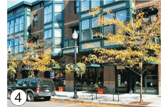
4 Ground-floor retail with residential above