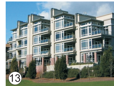
13 Large front setback with lawn and landscaping