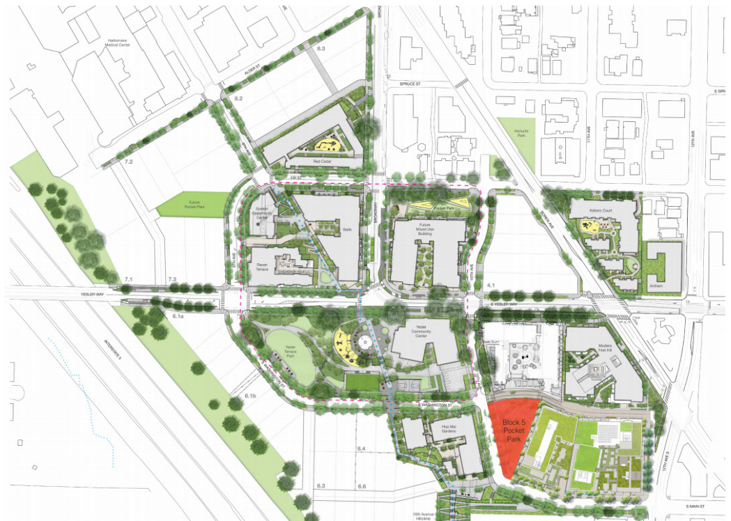
Figure 1: Project location