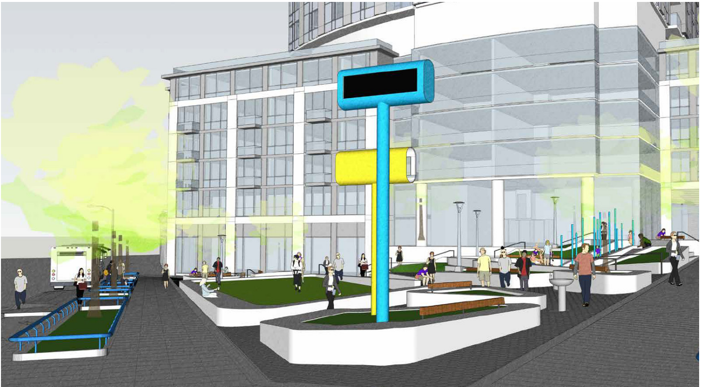
Figure 2: Proposed artwork design

along Lenora St will include a series of small street rooms with seating as well as a landscape buffer with street trees and low-lying fencing to protect the planting areas. See figure 1 for more detail.