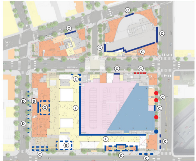
Figure 1: Art program for the WSCC expansion

Matt Griffin introduced the public benefit package and the public participation process used to develop the package that included presentations to neighborhood associations, public and online open houses, public meetings, media outreach, and paid advertising. The WSCC team assigned a value of $30 million to the proposed public benefit package. The project team arrived at this value by comparing the public benefit cost of the expansion to the public benefit costs of the Amazon Rufus development and the Arena.