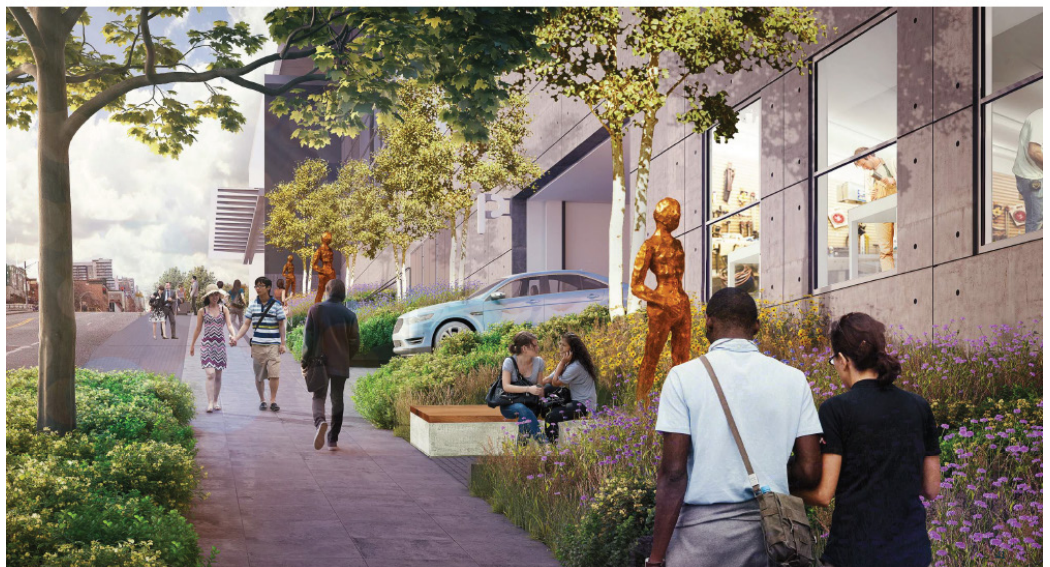
Figure 3: Public benefit art in the Boren Ave setback